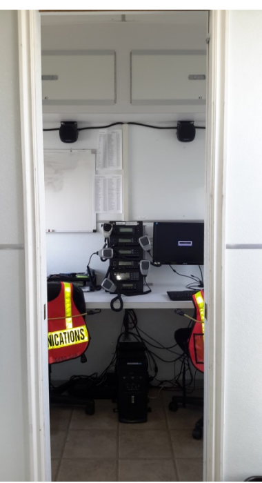
Communications Room of Search & Rescue Command Post Trailer