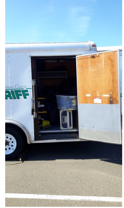
Search & Rescue Supply Trailer