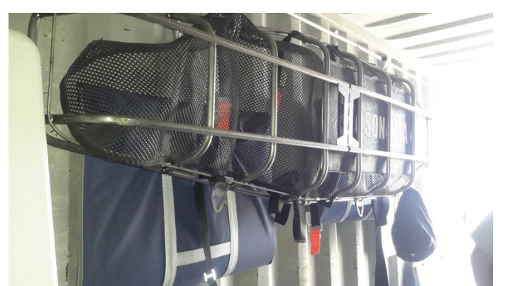
Rescue Litter – 31 lbs. empty; 2 to 6 person carry with patient Trailer Hitch- 40 lbs.