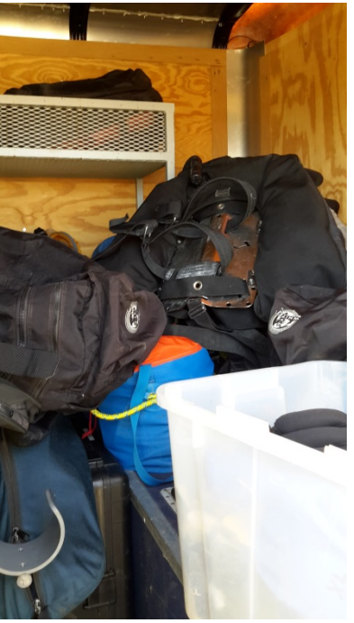
Search & Rescue- Dive Equipment Weight of SCUBA Gear varies by Diver's weight, preference, Location of dive (type of water), personal preference