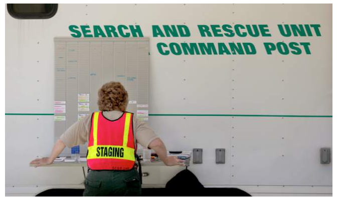
Search & Rescue Command Post Trailer