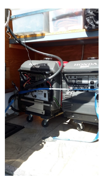
Portable Generators to power Search & Rescue Command Post Trailer Generator 134 lbs. each; 2 person lift