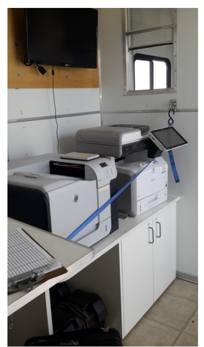
Equipment in Search & Rescue Command Post Trailer

Medical Equipment - up to 23 lbs. Store at 30 inches high