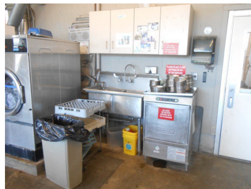
Sanitizer for Food and Water Bowls (Dishwasher)