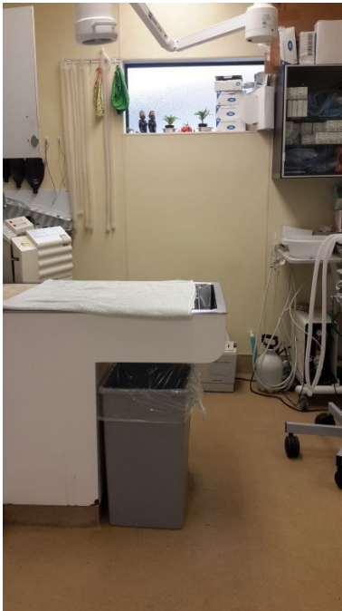
Exam Room- Table Height at 39"