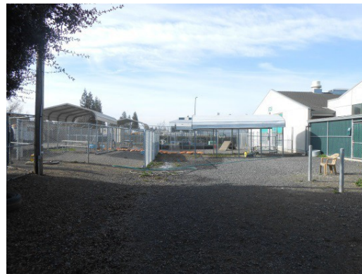
Exercise Yard for Dogs