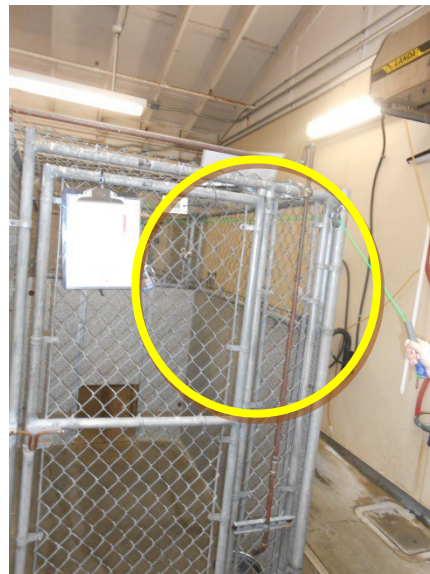
Guillotine Door Pull-40 lbs. pull force Dog Kennel