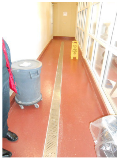
Adoptable Cat Hallway