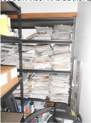
Supply Storage Room