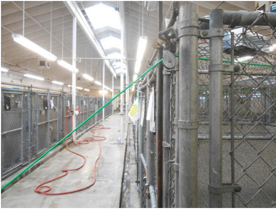
Guillotine Door Pull-40 lbs. pull force Dog Kennel