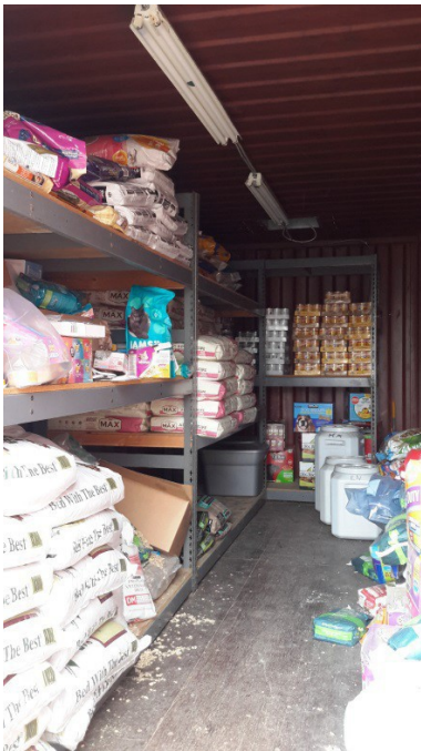
Food and Litter Storage