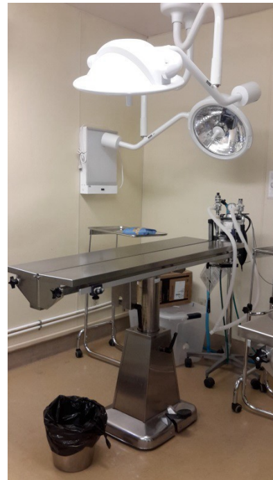
Operating Table- Adjustable Height