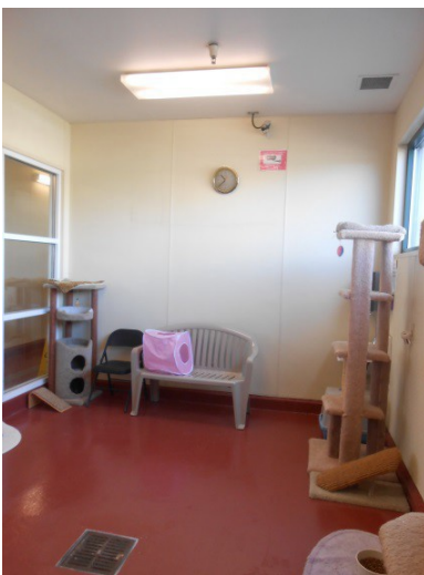
Community Cat Room