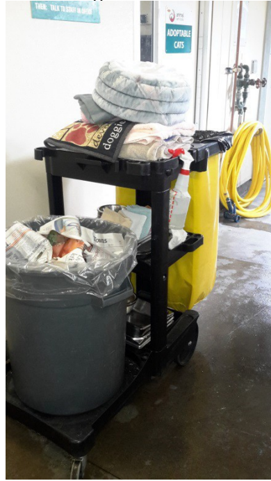
Kennel/Cage Cleaning Cart