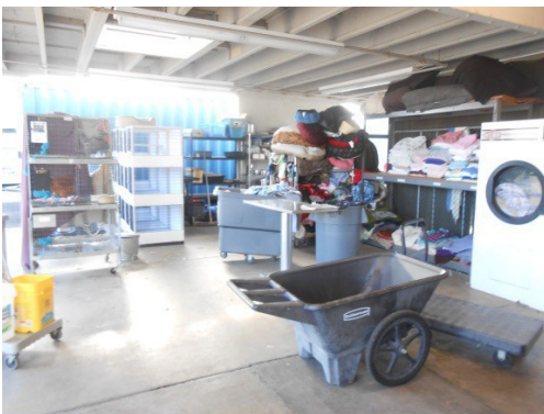
Laundry Area- Washer and Dryer