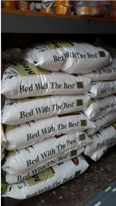
Kitty Litter- 38 lbs. from 6" to 36" high