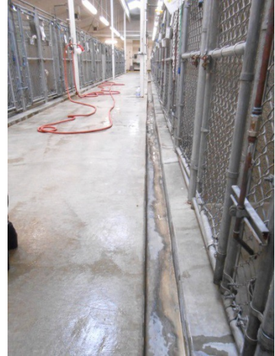
Row of Dog Kennels