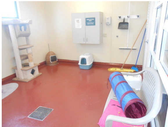
Community Room for Cats