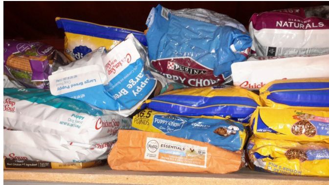
Bags of Puppy Food- weighing up to 30 lbs.; stored from 6" to 68" high