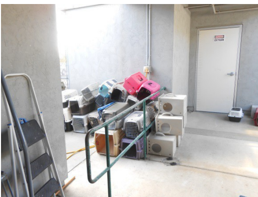
Storage of Carrying Crates/Cages