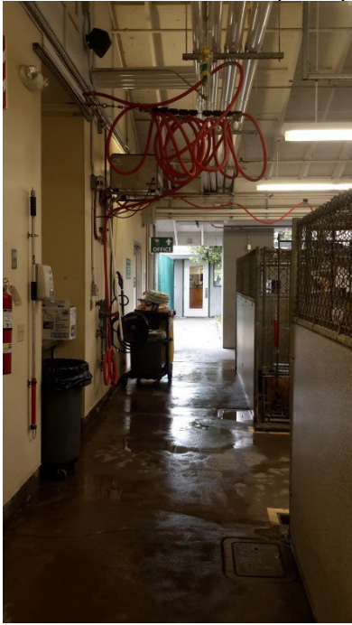
Overhead Hose Pulley System