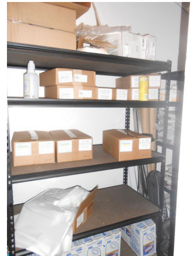
Supply Storage Room