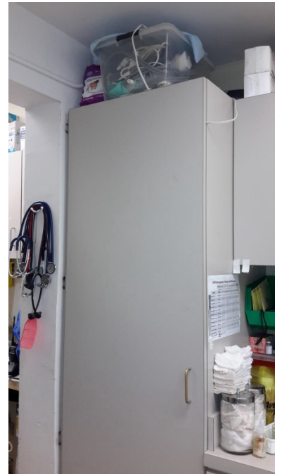
Veterinary Clinic Storage-up to 80"