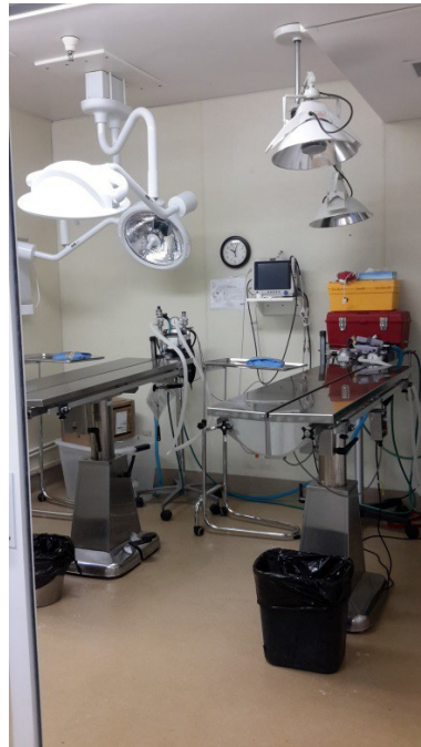
Surgery Suite-adjustable height Operating Table