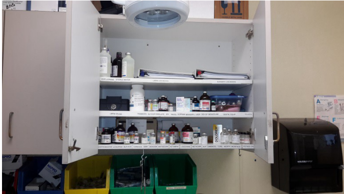
Veterinarian Clinic Medication Storage