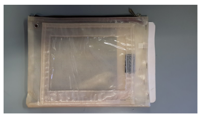
Inmate Property Bag- 8" x 11"; up to 4 lbs. full of items