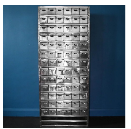
Example of Property Storage Drawers-Top Drawer handle at 80 inches high Lowest handle at 8 inches high