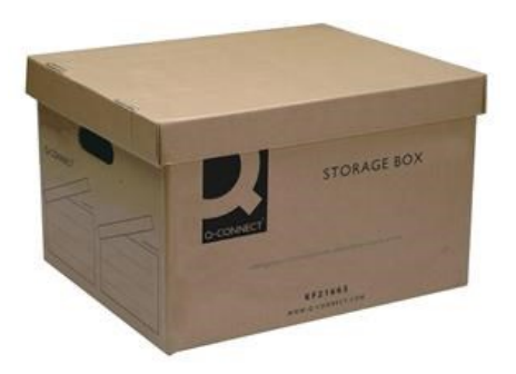
Example of a File Box- Average weight 29 lbs.; heaviest weighed at 33lbs. Stacked up to 42 inches high