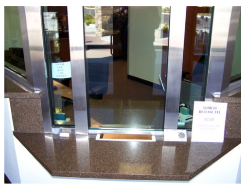
Example of Security Window in Lobby Can be difficult to communicate through