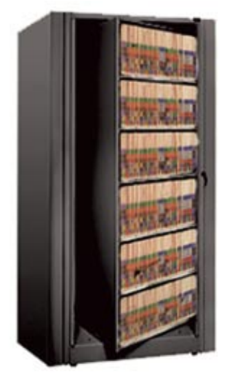
Example of rotating file storage Top shelf at 69 ½ inches high Push/Pull Force- 27 lbs.