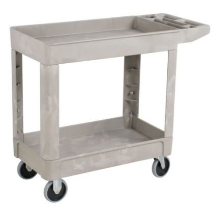
Example of cart used to transport heavy objects