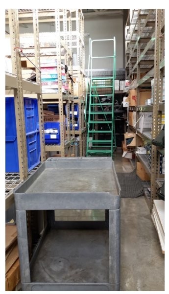
Supply Cart and Ladder