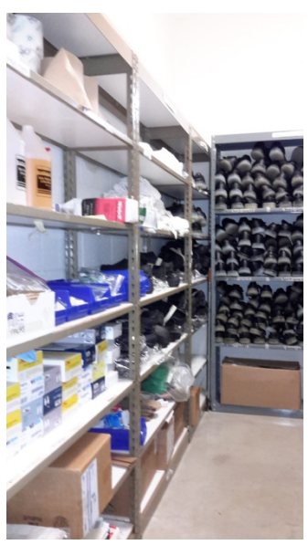
New Shoes and Toiletries