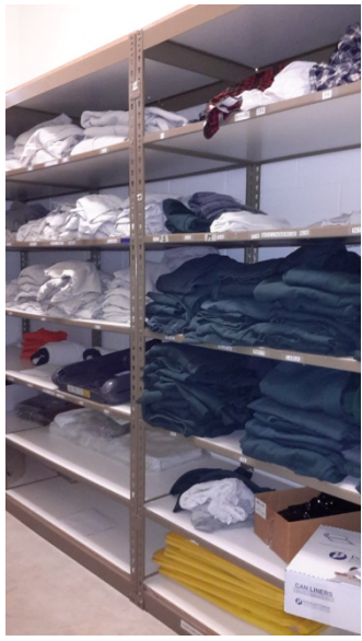
Clean Linen and Clothing