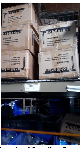
Sample of Supplies- Razors 13"x10"x8" - 12 lbs. Stored up to 83 inches high