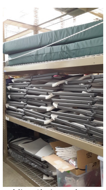
Folding Chairs and Mattress storage