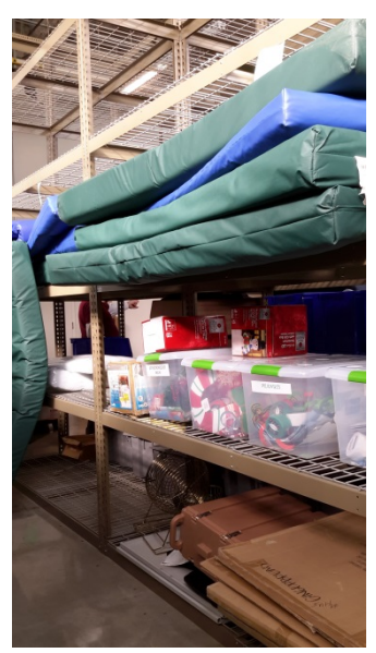
Additional Mattress Storage