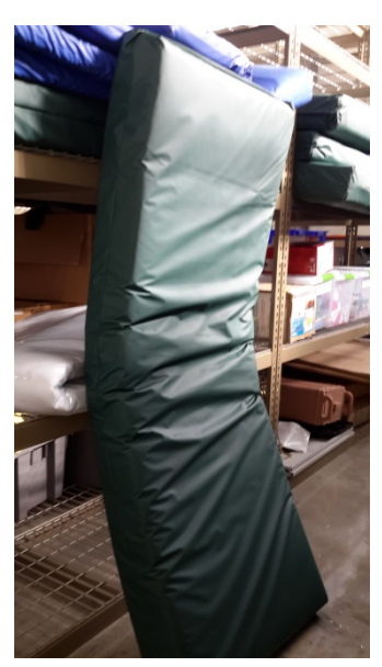
Sample Mattress Average weight- 23 lbs.