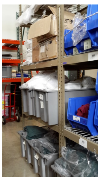
New Clothing and Linen Bundle of Towels- 15 lbs. Stored up to 90 inches high