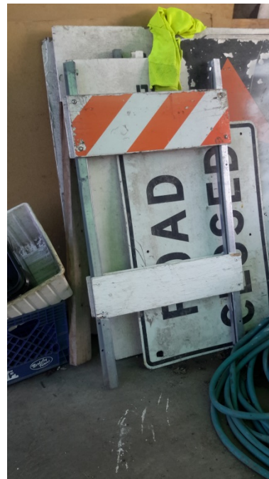
Supervised Adult Crew (SAC) Barricade- 13 lbs.