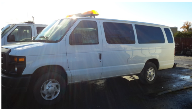
Supervised Adult Crew (SAC) 12-15 Passenger van- 1 st step- 18" from ground, 2 nd step- 7" additional to van floor. 45" inches from Ground to Driver's seat.