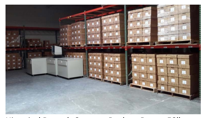
Historical Records Storage- Bankers Boxes- 50lbs.