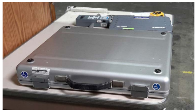
Single Voter/Privacy Booth- 23" x 20" x 4" – 14lbs.