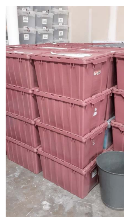
Foreground(pink)- Used Ballot Box 20" x 21" x 11" – 51 lbs. to 59inches Background(clear)- box of unused Ballots 20" x 21" x 11" – 44 lbs. up to 36 inches