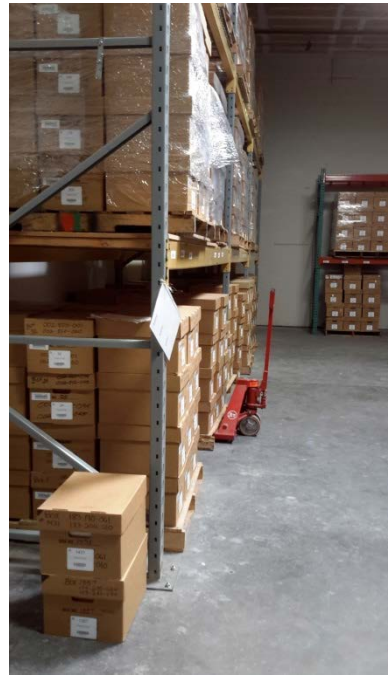
Historical Records Storage