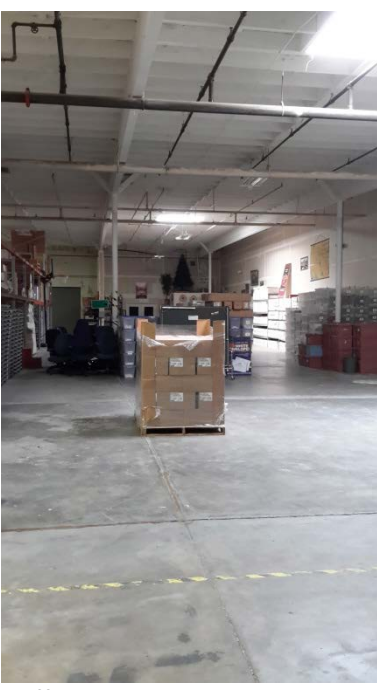
Coffey Lane Warehouse