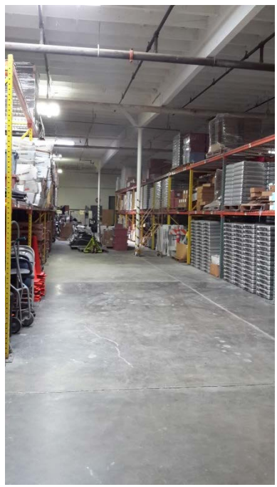
Coffey Lane Warehouse