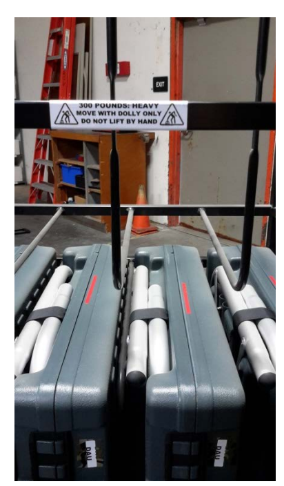
Full DAU Cart- Pull Force- 27.33 lbs.