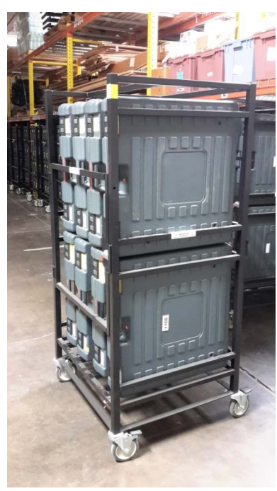
Disable Access Units- (DAU) 25" x 25" x 6" - 25 lbs. moved from 25 inches to 48 inches high