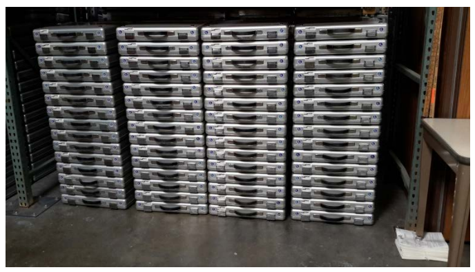
Stack of Voter/Privacy Booths- from floor to 50 inches high