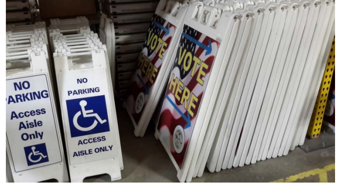
Folding Signs of various shapes and sizes-Largest sign 28 lbs. with handle height at 45 inches

Incumbent has access to Forklift for heavy items that are stored overhead; safety ladders and pallet jacks are placed strategically throughout the warehouse to aid in lifting items to higher shelves and prevent injury moving heavy or overhead items.