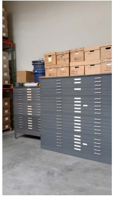
Historical Records Storage Maps and Blueprints