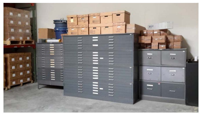
Historical Records Storage