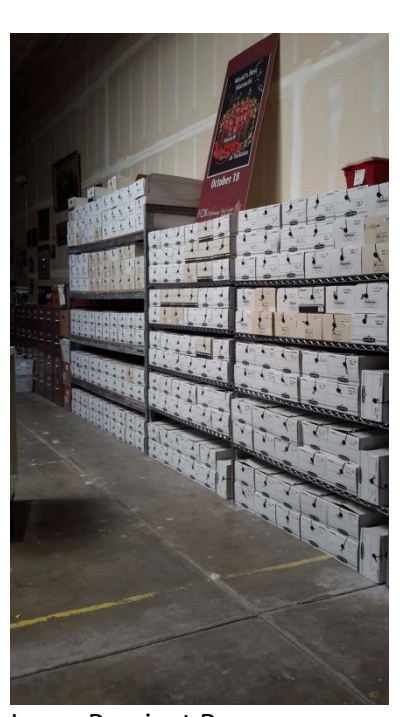
Large Precinct Box-20"x13"x9" 18 lbs. from 12" to 72"