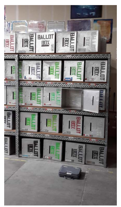
Ballot Box- 5lbs. Floor to 59" high shelf