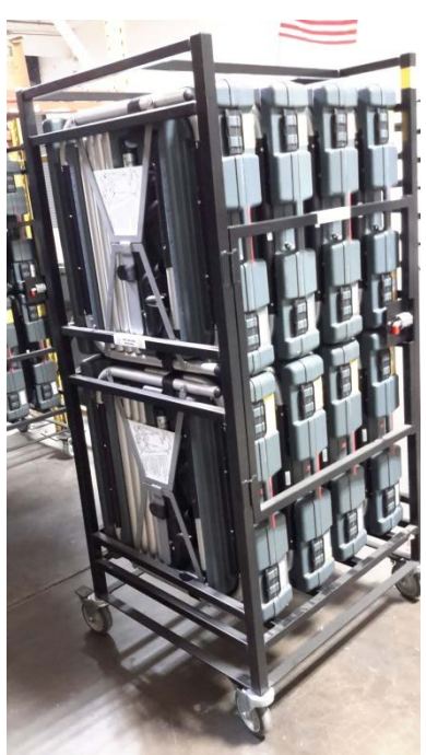
Full DAU Cart- Push Force- 34.67 lbs.