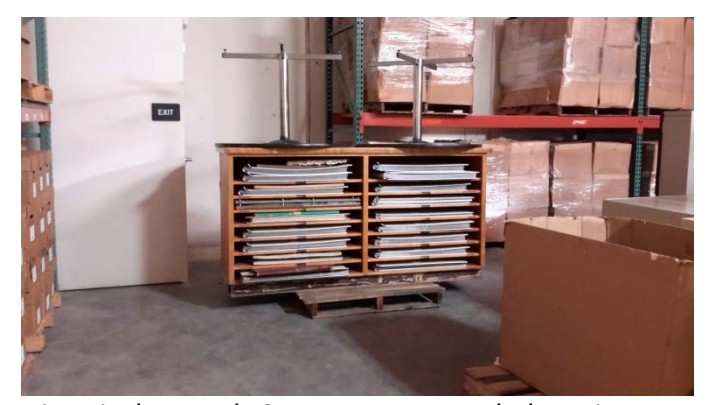
Historical Records Storage- Maps and Blueprints