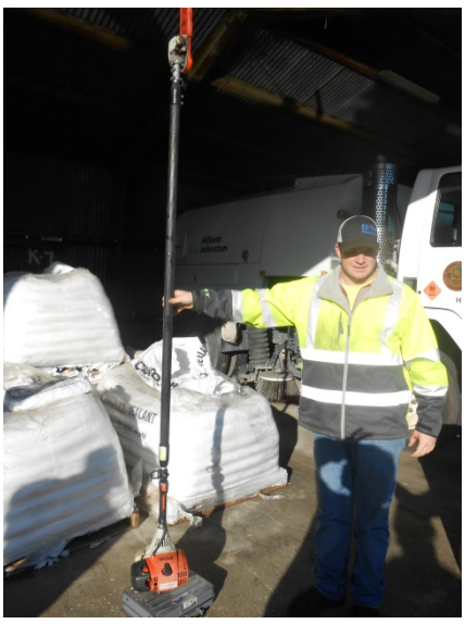
Pole Saw – 17 lbs. Shortest at 107" Extends to max of 180" (15')