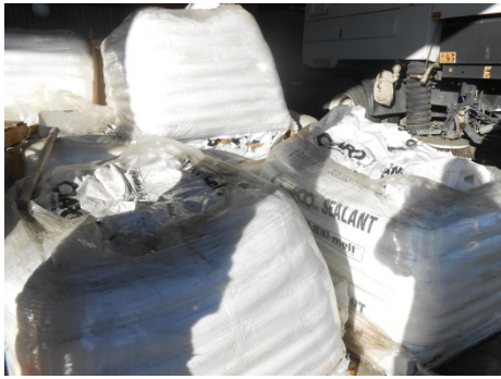
Crack Sealant- 25 lbs. per bag 50 bags per pallet