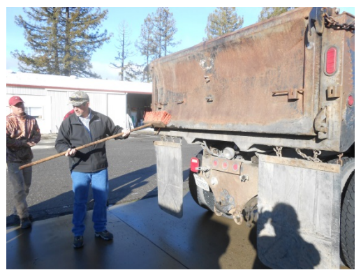
Bobtail Dump Truck- 39 inches to Bed of truck/gate