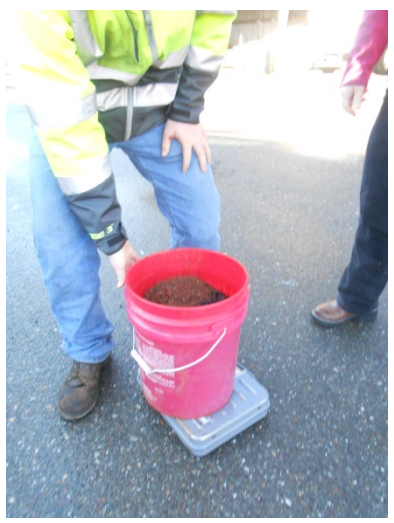
Cold Mix Bucket- 50 lbs.