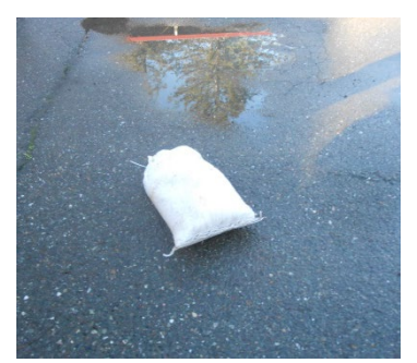
Sand Bag- 28 lbs.