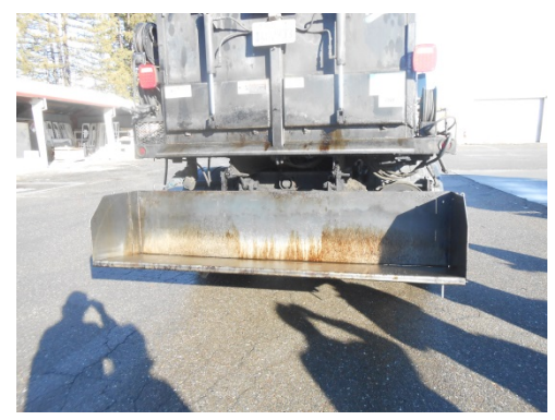
Bobtail Asphalt Patch Truck – 19 inches to lowered gate.