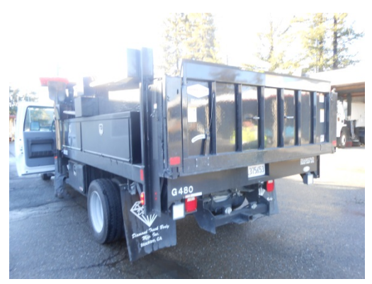
Work Truck with Lift, step to enter Driver's side 16 inches