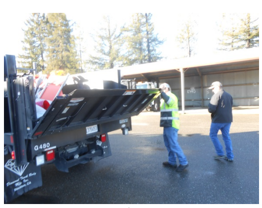
Work Truck with Lift