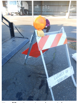
Traffic Barricade with sign- 17 lbs.