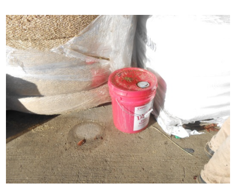
Pavement Finisher Bucket- 40 lbs.