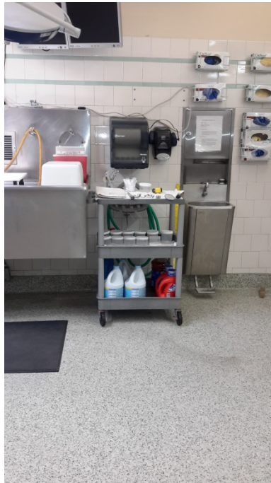
Cleaning supplies and specimen cups