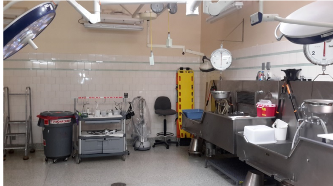
Autopsy Suite- Cart with Autopsy supplies; Bio Hazard Waste