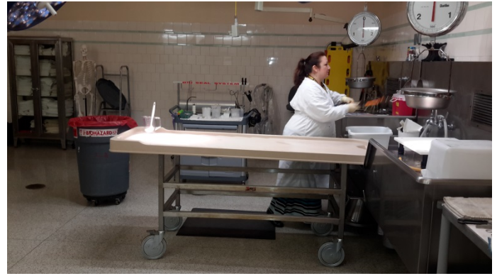
Sample posture of Forensic Assistant during an autopsy