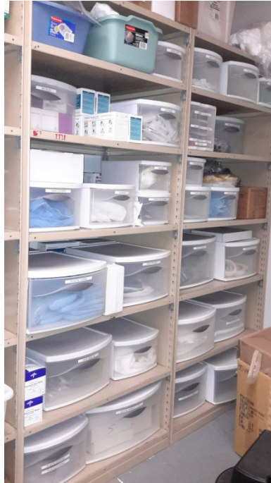
Storage of supplies up to 80 inches- Items weigh less than 10 lbs.