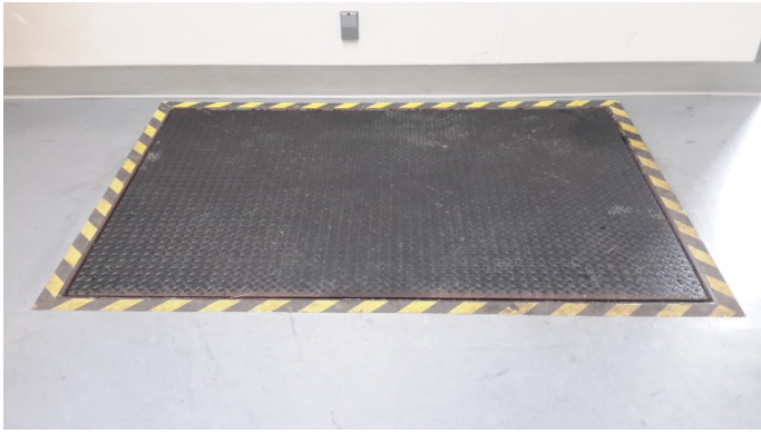
Scale to record weight upon receiving remains