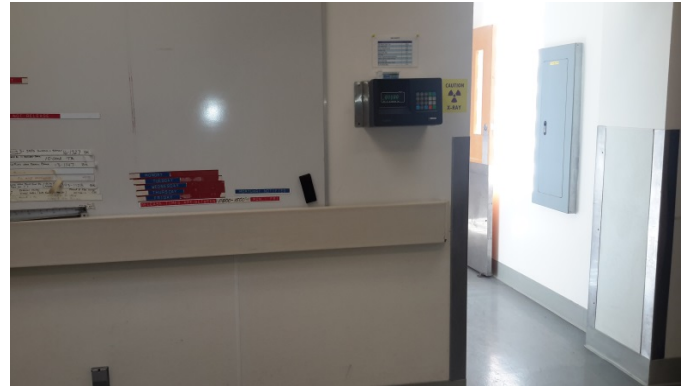
Scale display to record weight upon receiving remains