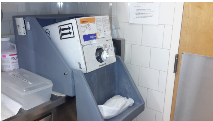
Formalin Cube- 42 lbs. lifted to 42 inches