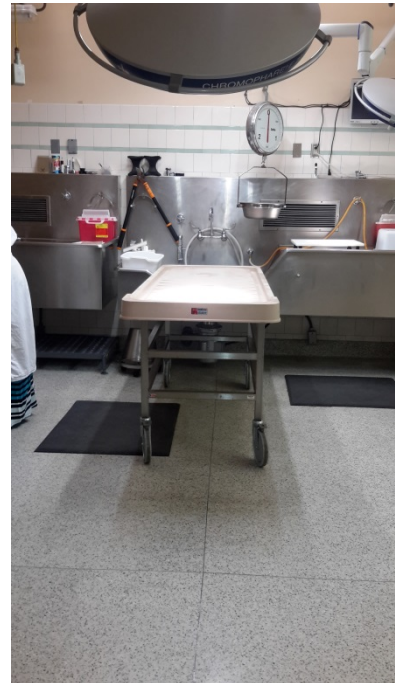
Autopsy Table and Chassis at sink