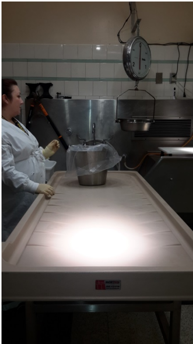
Organ Collection Bucket- Placed between legs