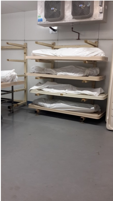
Cold Room- Remains storage