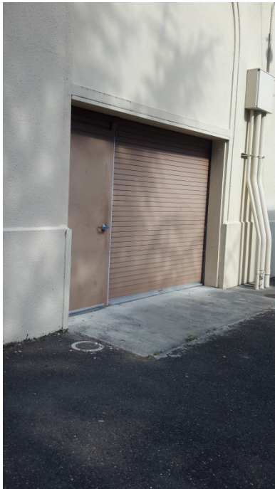
Access to outside storage