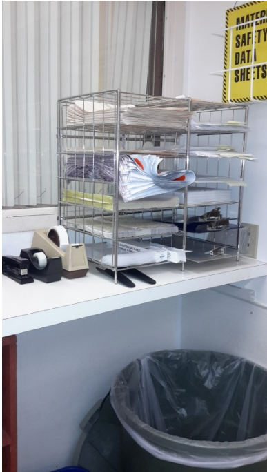
Intake and Release files