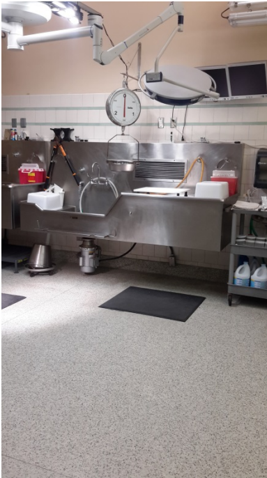
Autopsy Suite- Sink, Drain, Scale