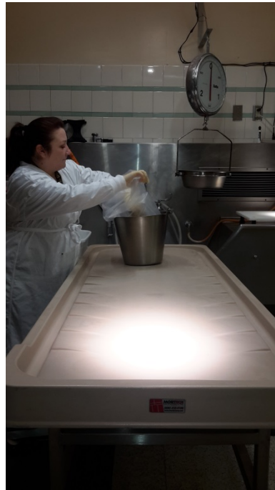
Organ Collection Bucket- Returned to body cavity in bag Once autopsy complete