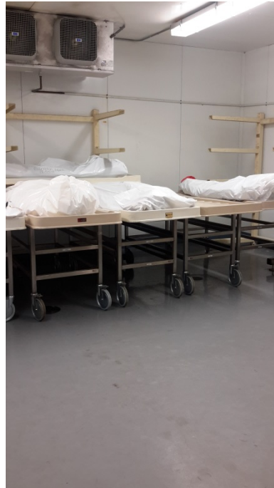
Cold Room- Remains storage Push Force of chassis- 44 lbs. Pull Force of chassis- 35 lbs.