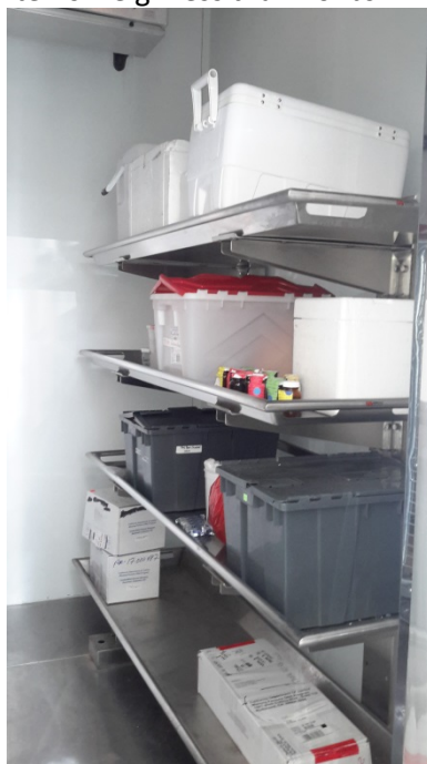
Freezer- storage of tissue and bone