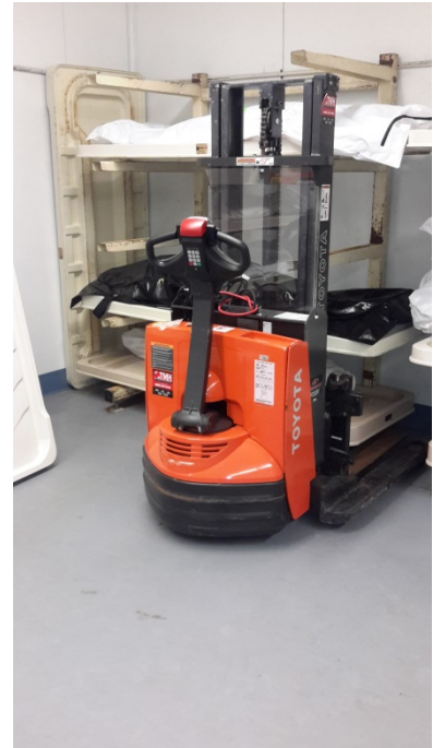
Fork lift to move remains and body trays / Table tops