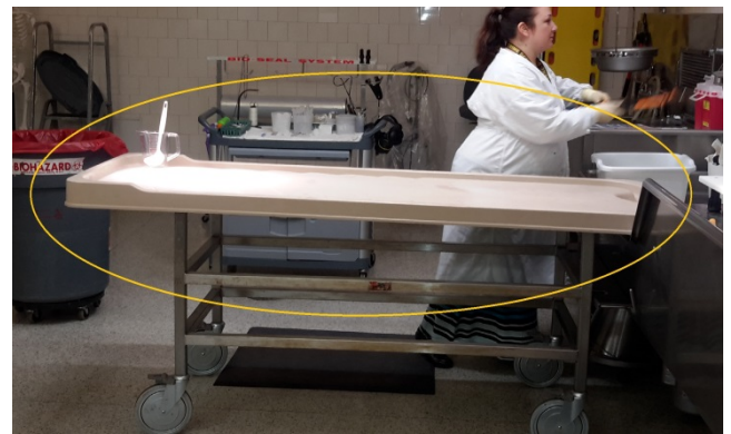
Body Tray/Table Top = 32.5 lbs. lifted to 36 inches