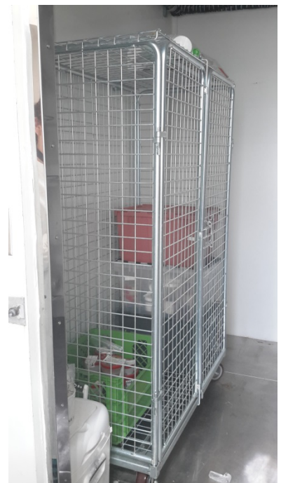
Freezer- Storage of soft tissues