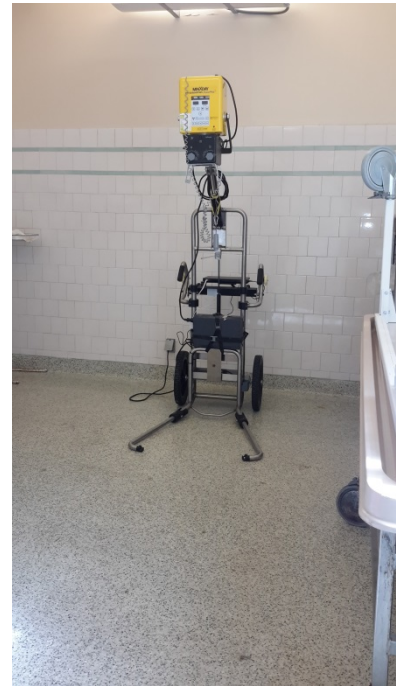
Portable Digital X-ray Machine