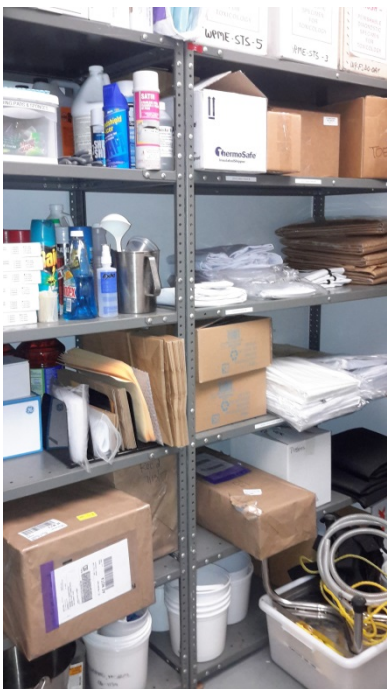
Storage- Body bags, specimen cups