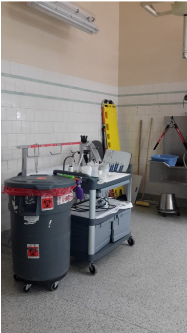
Autopsy supply cart and waste bin