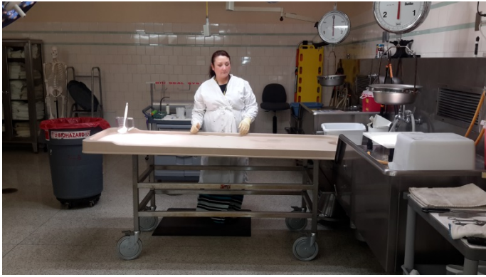
Sample posture of Forensic Assistant during an autopsy Body tray/Table top at 36 inches on chassis