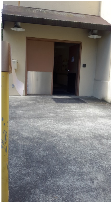
Ramp to reenter building from outside storage