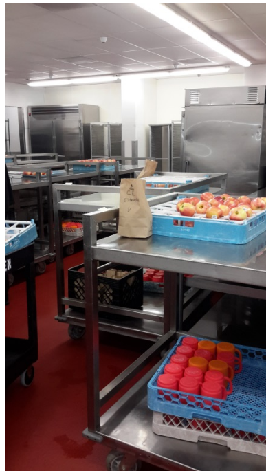
Meal Cart- Lunch Prep