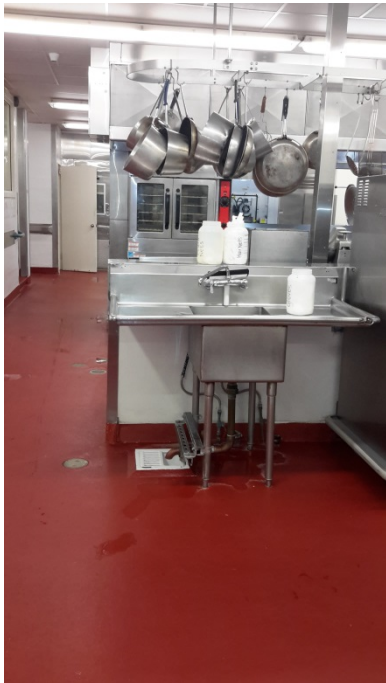
Pot Storage above Hand Washing Sink