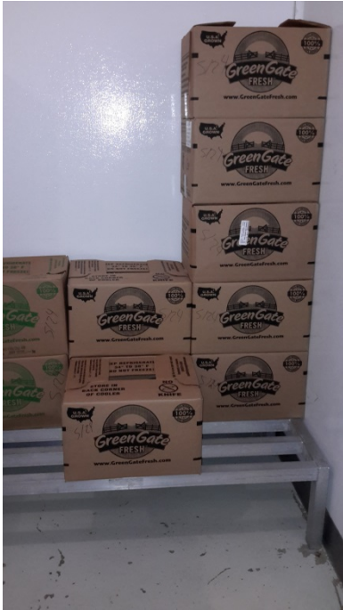
Cold Storage- Boxes of Lettuce or Cabbage- 20 lbs. up to 72"