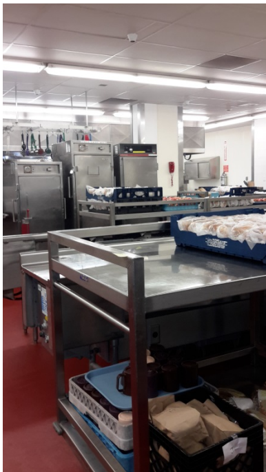
Lunch items- from 6 to 48 inches