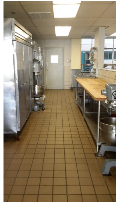
Baking Prep Area; Mixers