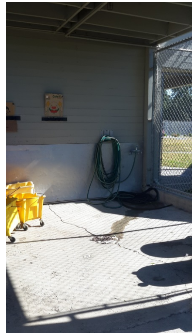
Area to empty mop bucket- no overhead lighting available