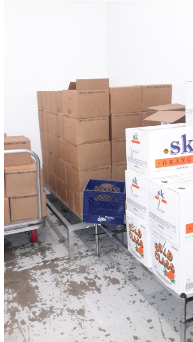
Cases of Apples and Oranges- 40lbs.