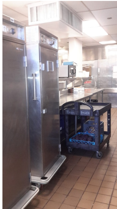
Reach in Freezer; Supply Cart