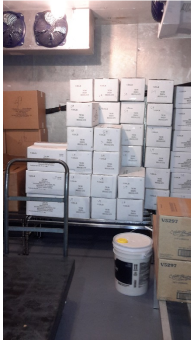
Broccoli Cuts- 20 lbs. From 12" to 72"