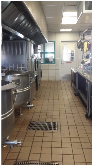
Tilting Kettles and Ovens