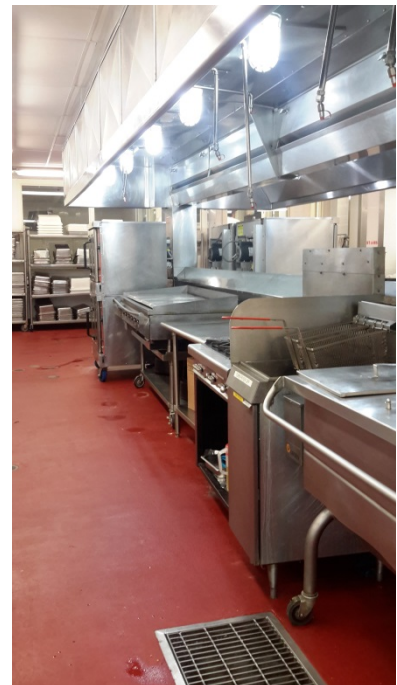
Deep Fryer, Stove Top, Grill, Ovens