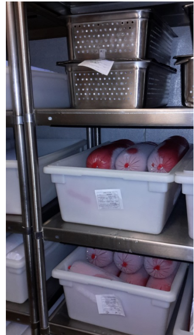
Bologna- 10 lbs. each tube