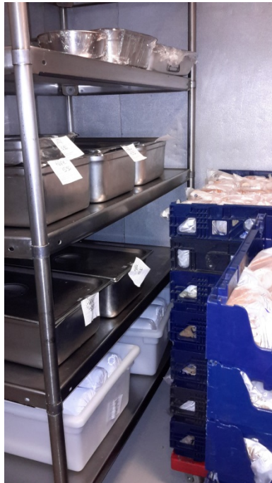
Food prepared for future meals