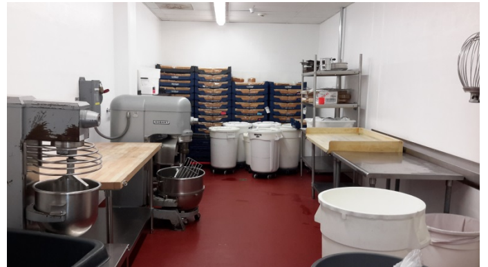
Baking Area- Racks of bread along back wall; Dry goods In rolling white bins; 2 mixers