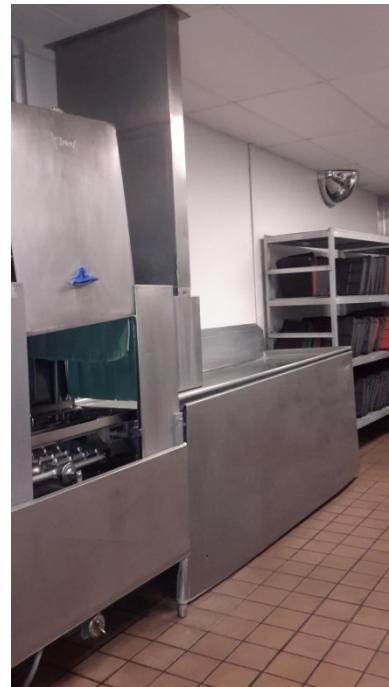
Dish Washer; Cart of meal trays