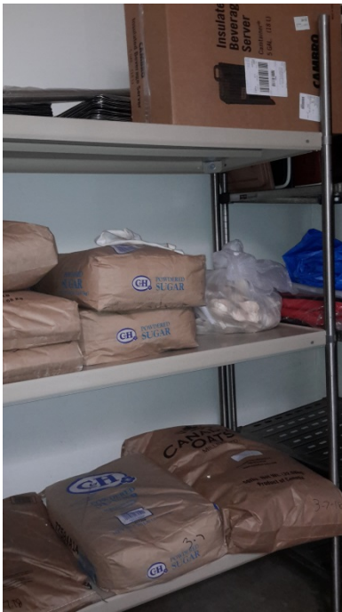
Powdered Sugar and Oats- 50 lbs. From 12" to 48"