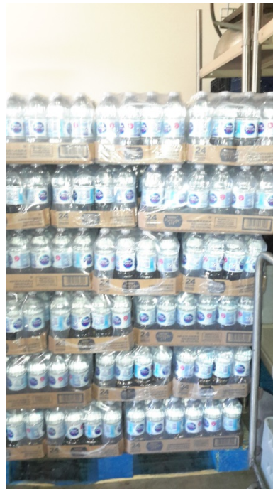
Emergency Water- 25 lbs.