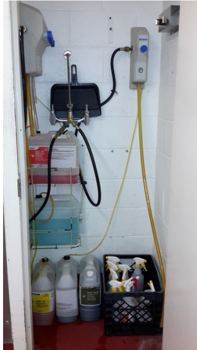
Janitor Closet- Cleaning solutions- 21 lbs., from floor to 40"