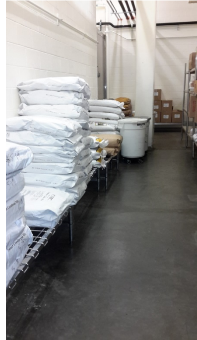
Dry Storage- Pinto Beans, Rice, flour, sugar, corn meal- 50 lbs. Canned Fruit – 43 lbs. up to 72"