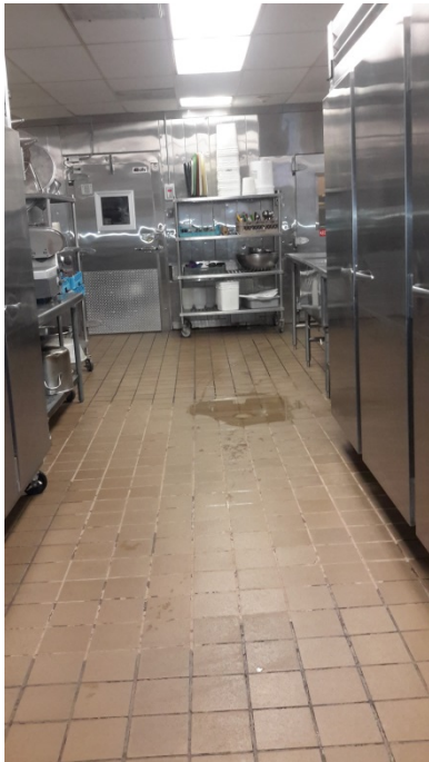
Reach in refrigerators on each Side of aisle