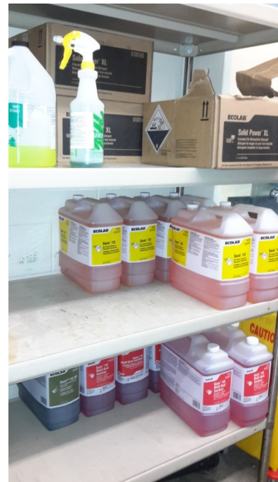
Cleaning Supplies- Various Lime Away- 1 gallon- 8 lbs. Solid Power XL- Case of 4, 36 lbs. Up to 54"