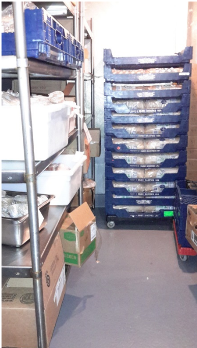
Various items in Refrigerator