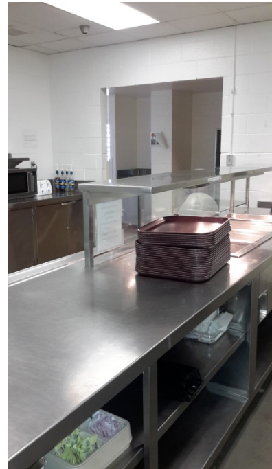
Staff Break/Lunch Room