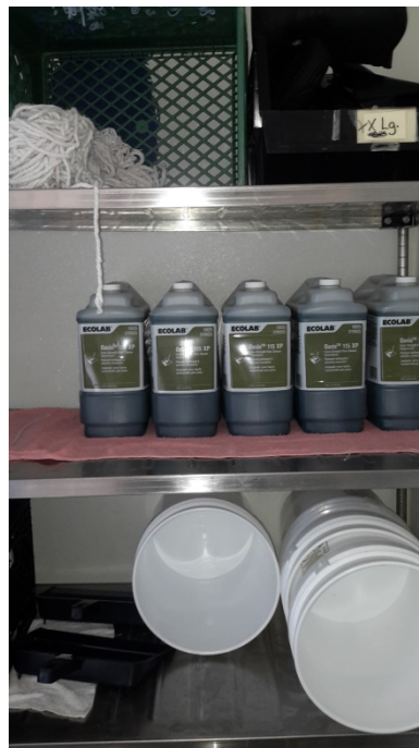
Cleaning Supplies and Solutions Oasis 115 XP floor cleaner- 21 lbs., up to 40"