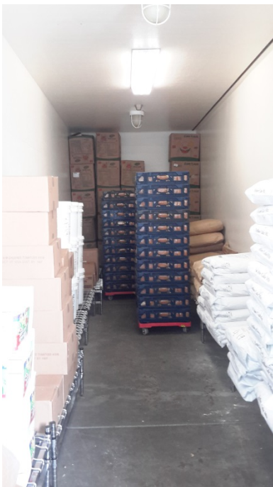
Dry Storage- Bread trays-up 80" Corn Flakes- 33lbs from 12" to 90" Pinto Beans- 50 lbs. from 12" to 64" Apple Jelly- 45 lbs. bucket with no handle, From 12 to 44"