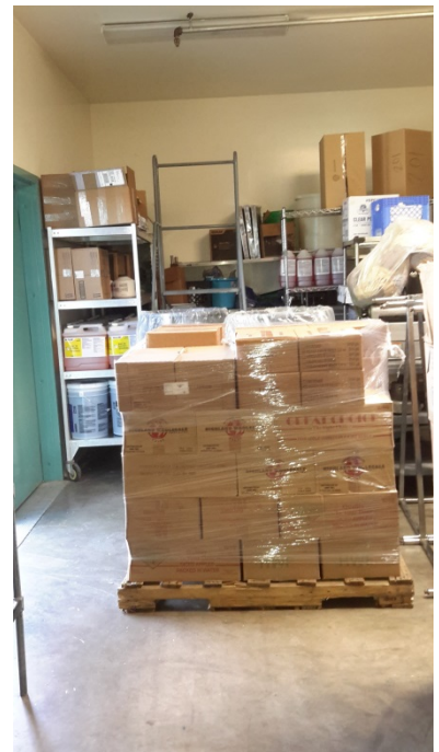
Delivery from Food Service