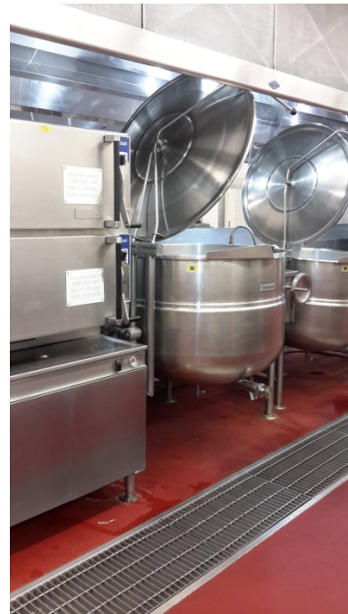
Tilting Steam Kettles