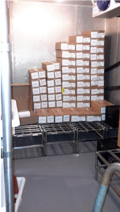
Packs of Baby Carrots- 20 lbs. From 12" to 72"