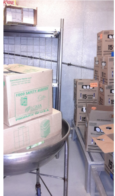
Refrigerator- Lettuce – 20 lbs. 15 Dozen eggs- 25 lbs. up to 48"