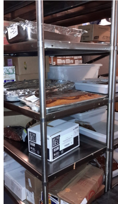
Variety of food items in refrigerator