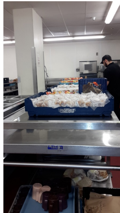
Cart for lunches- 48 inches high