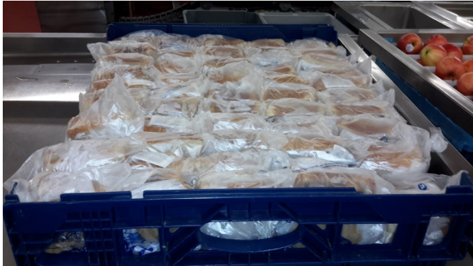
Lunch Tray (sandwich, cookies, juice packet) - 35 lbs.