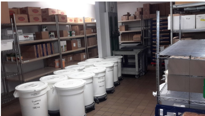
Dry Storage- Dry ingredients in white rolling bins; Case of #10 can crushed tomatoes- 44 lbs., From 12" to 64"