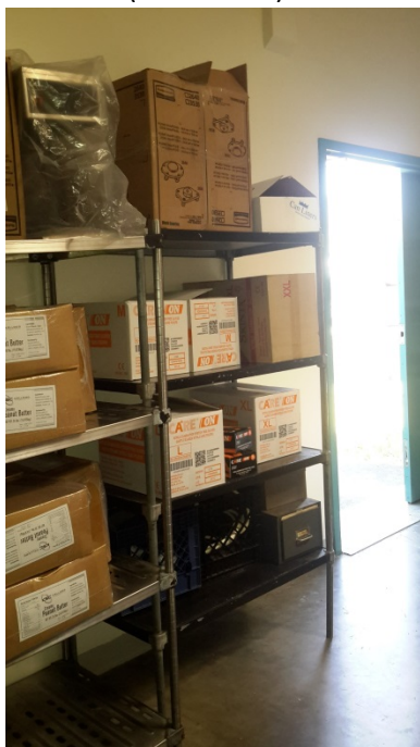
Dry Storage- Nitrile Gloves- 15lbs.