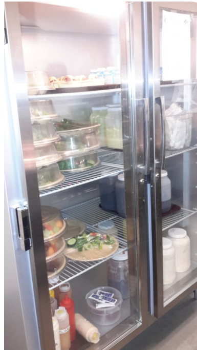
Staff Reach in Refrigerator in Break/Lunch Room