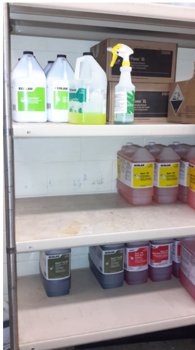
Cleaning Solutions- Various 2.5 Gallon- 21 lbs. up to 36"