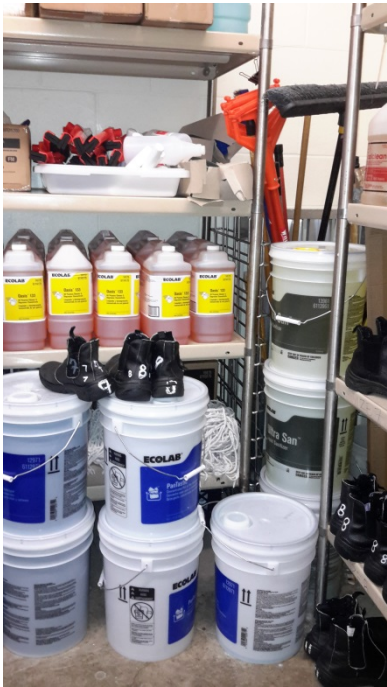
Non-Slip Shoes for inmates; Cleaning Solutions- 5 gallon, 55 lbs. Up to 32"