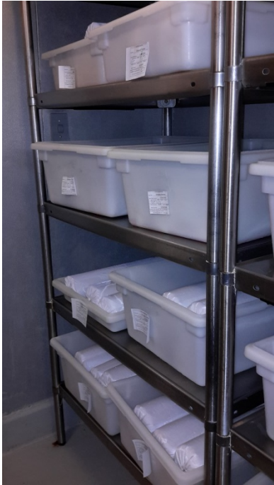
Ground Chicken- 10lbs. each tube