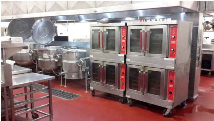
Ovens, Tilting Kettles