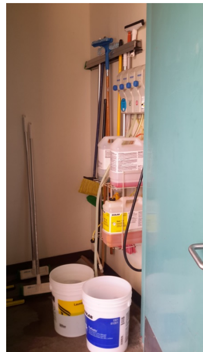
Cleaning Supplies and Solutions Various Solutions- 21 lbs. up to 40"