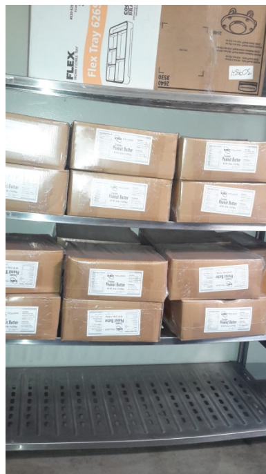
Case of Peanut Butter Packets- 35 lbs. From 12" to 48"