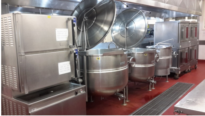
Steamer, Steam Kettles, Ovens