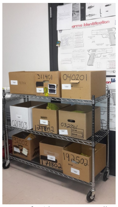
Boxes of Evidence- up to 30 lbs. Lifted by handles from 6 inches Up to 80 inches