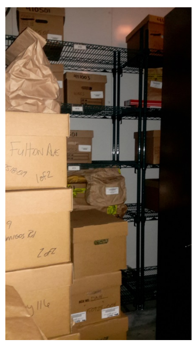
Evidence in Cold Storage- up to 30 lbs. Lifted by handles from floor Up to 80 inches