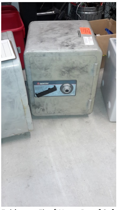
Evidence- Fire/Water Proof Safe-90 lbs. - one person lift