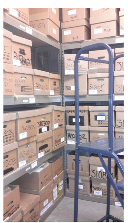
Boxes of Evidence- up to 80 inches Safety Ladder to access higher items