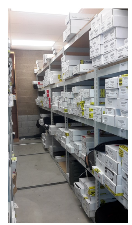
Storage of Firearms and Knives From 6 inches to 80 inches