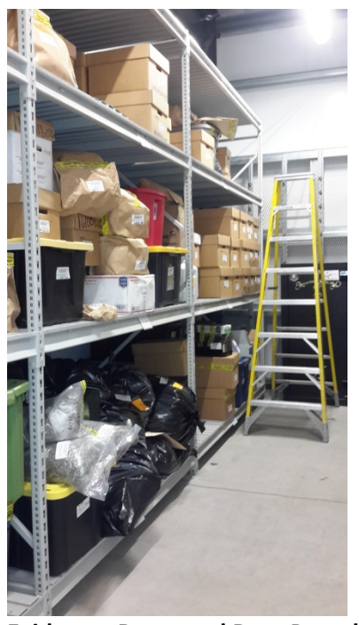
Evidence- Drugs and Drug Paraphernalia Stored from 6" to 80"