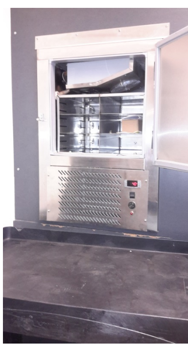
Refrigerator for Fluid or Tissue Samples