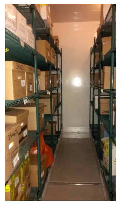
Boxes of Evidence