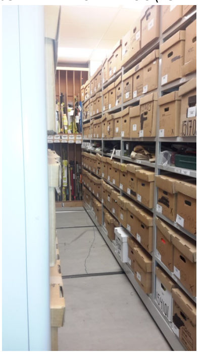
Rolling Storage Shelves- up to 80"