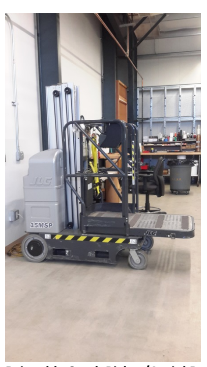
Driveable Stock Picker/Aerial Boom Lift