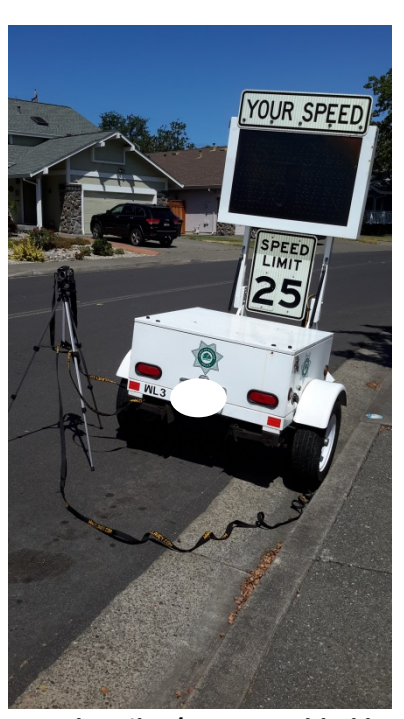
Speed Trailer (camera added by a local citizen)