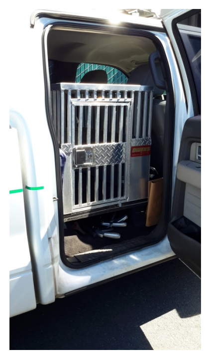
Animal Cage in back of Duty Vehicle -floor of cage at 32 inches