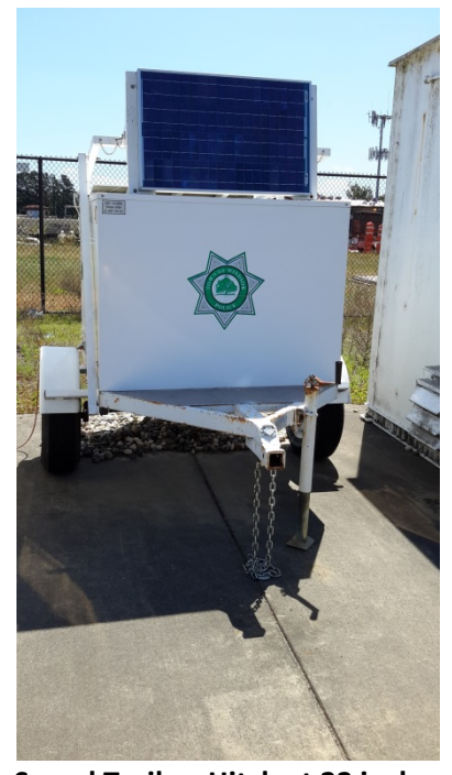
Speed Trailer- Hitch at 22 inches