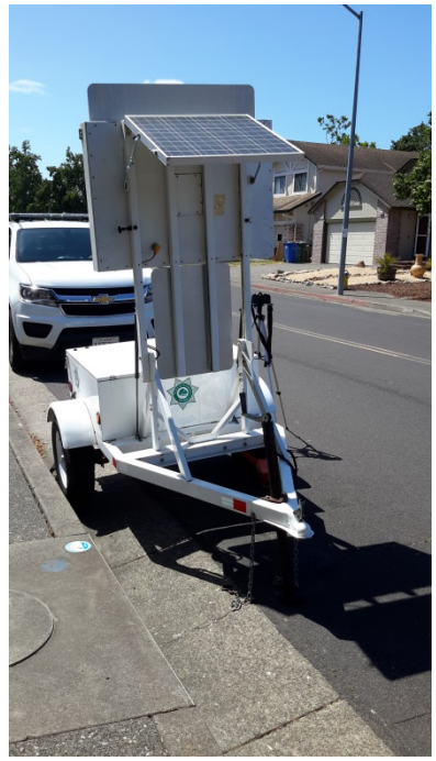
Speed Trailer- Hitch at 16 inches