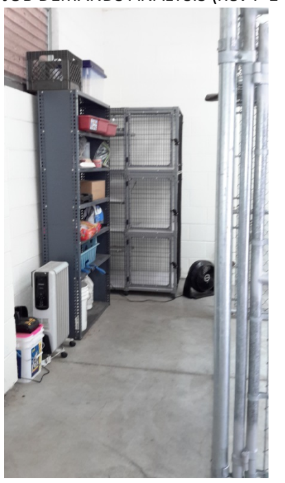
Kennel Storage at Sonoma Police Department