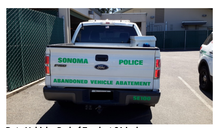
Duty Vehicle- Bed of Truck at 31 inches