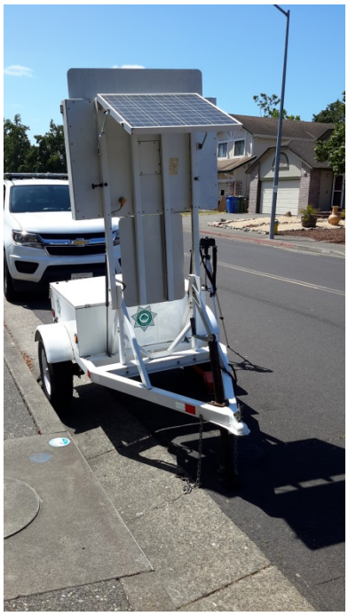
Speed Trailer- Hitch at 16 inches