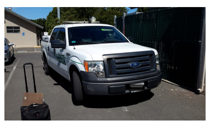
Duty Vehicle- Bed of Truck at 31 inches