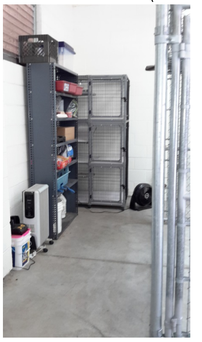
Kennel Storage at Sonoma Police Department