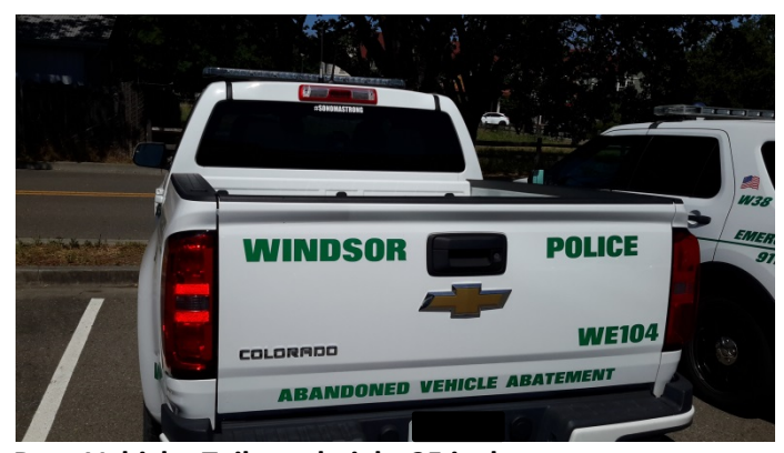
Duty Vehicle- Tailgate height 35 inches