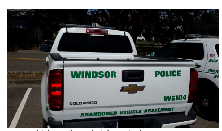
Duty Vehicle- Tailgate height 35 inches