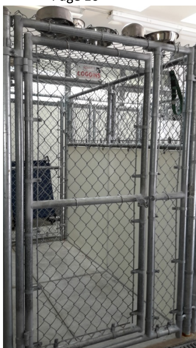
Kennels at Sonoma Police Dept.