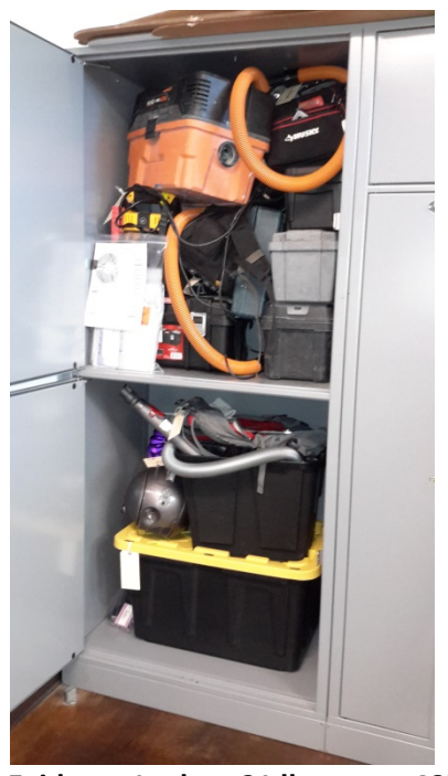
Evidence Locker- 31 lbs. up to 48"