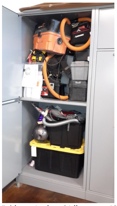
Evidence Locker- 31 lbs. up to 48"