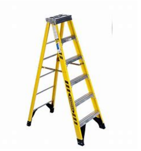
6 foot ladder- 25 lbs.