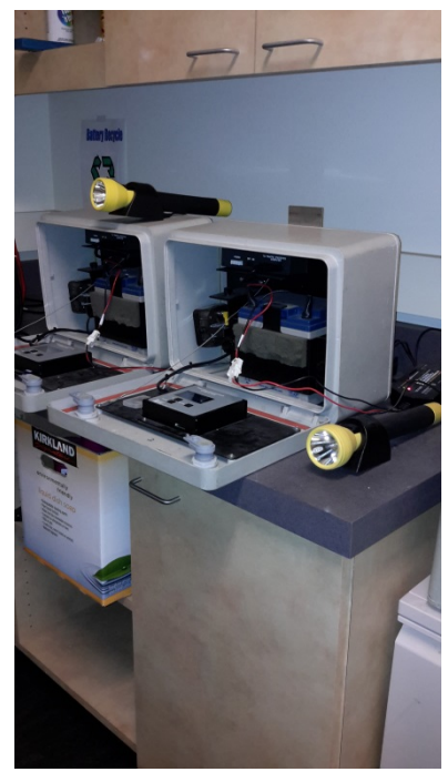
Radar Recorder Kit- 40 lbs. Stored on 39 inch counter top Carried 25' to Duty Vehicle Installed at 72 inches or above ground