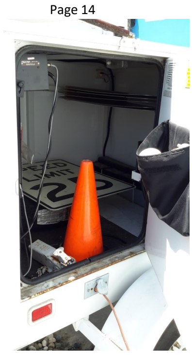
Speed Trailer Storage Traffic Cone - 11 lbs.