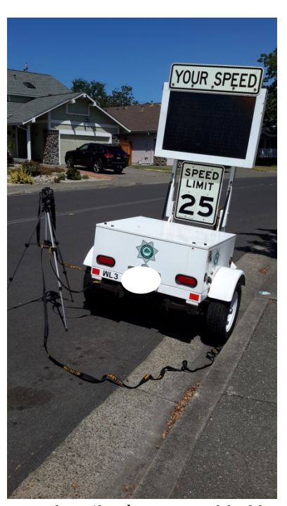
Speed Trailer (camera added by a local citizen)