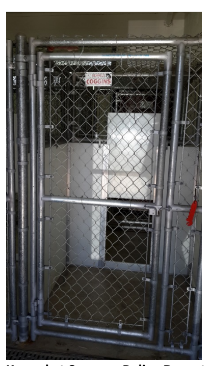
Kennel at Sonoma Police Department