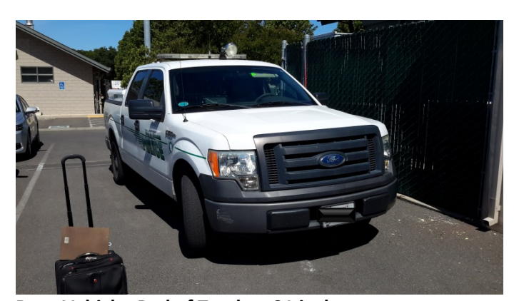
Duty Vehicle- Bed of Truck at 31 inches