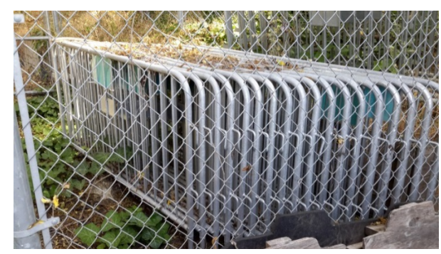
Barricades- 44 lbs.