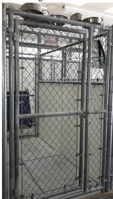
Kennels at Sonoma Police Dept.