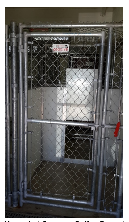
Kennel at Sonoma Police Department