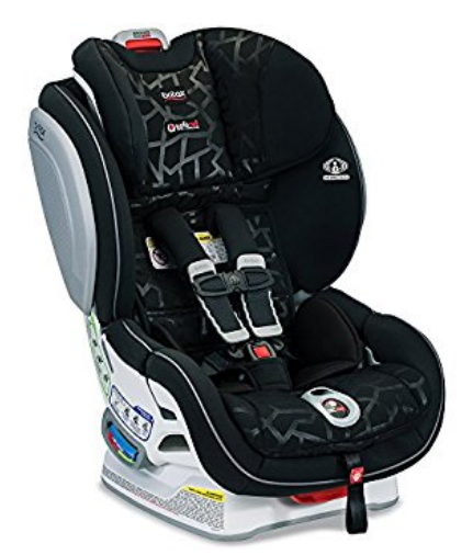
Child Safety Seat- up to 30 lbs.