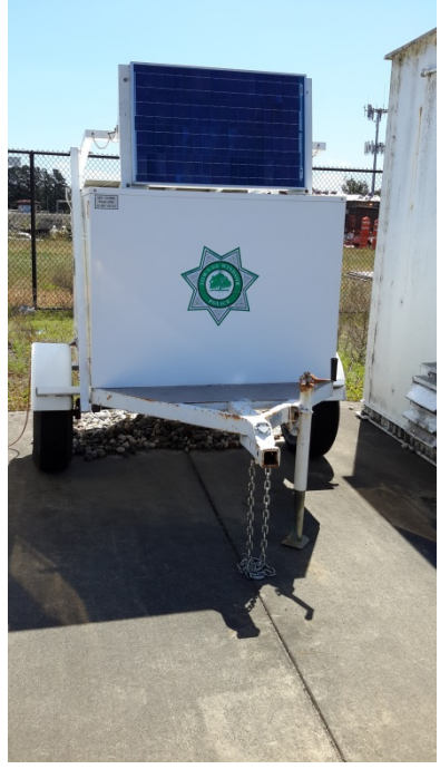
Speed Trailer- Hitch at 22 inches