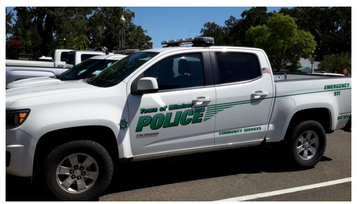
Duty Vehicle- Tailgate height 35 inches