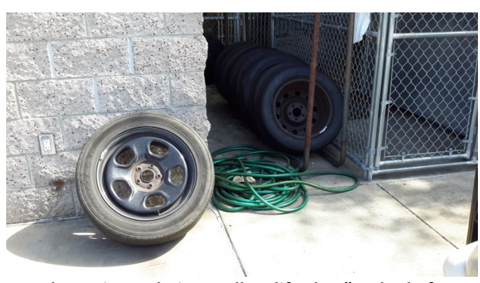
Patrol Car Tire and Rim- 70 lbs.; lifted 31" to bed of Duty Vehicle