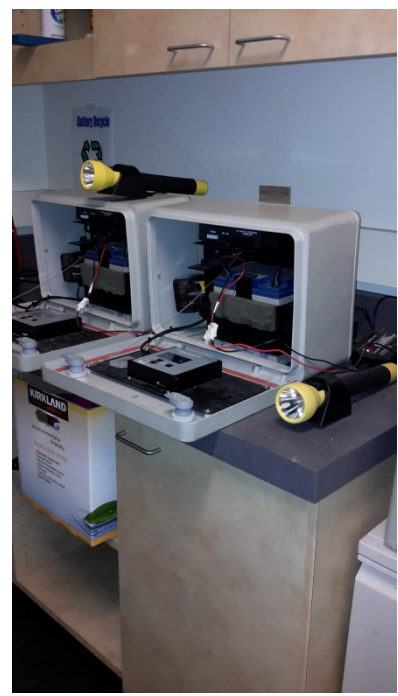
Radar Recorder Kit- 40 lbs. Stored on 39 inch counter top Carried 25' to Duty Vehicle Installed at 72 inches or above ground