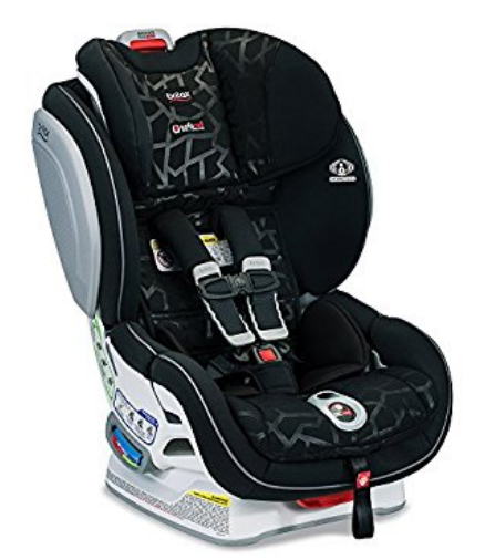
Child Safety Seat- up to 30 lbs.