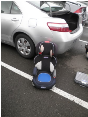
Booster Seat with Back- 9 lbs. Booster without Back- 5 lbs.