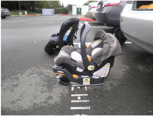
Infant car seat and carrier- 16 lbs. (empty) Average infant – 20 lbs.; total 36- lbs.