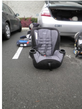
Toddler car seat- 8lbs.