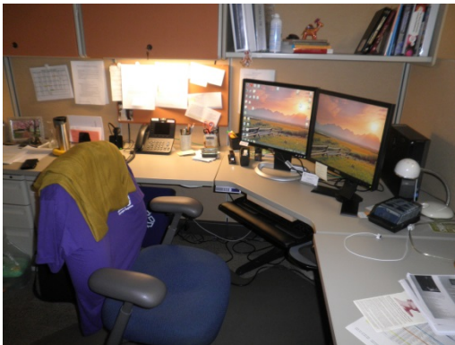
Shared work stations