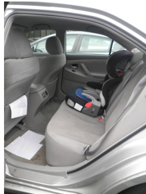
Reach of 40" to middle buckle.