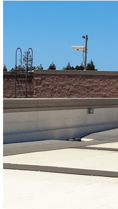
Camera on Roof- serviced by Building Mechanics