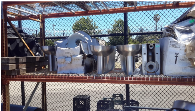
Stainless Steel Toilets- 15lbs. up to 48"