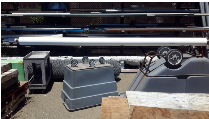
Light Poles and Electrical Conduits