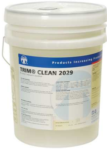
5 gallon bucket of oxidizer- 55 lbs.