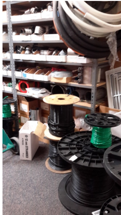
Spools of wire- up to 65 lbs.