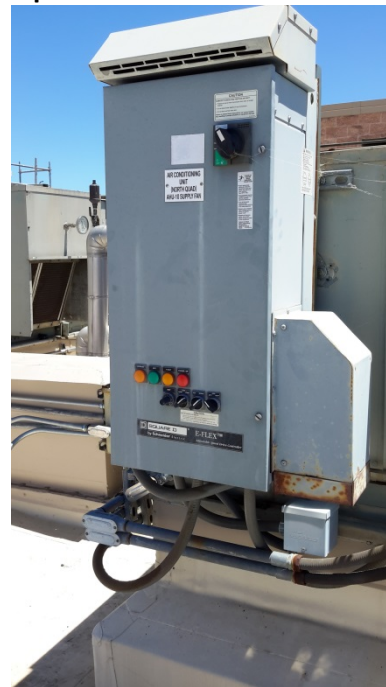
VFD Distributor- Lock Out/Tag Out required for maintenance and repair