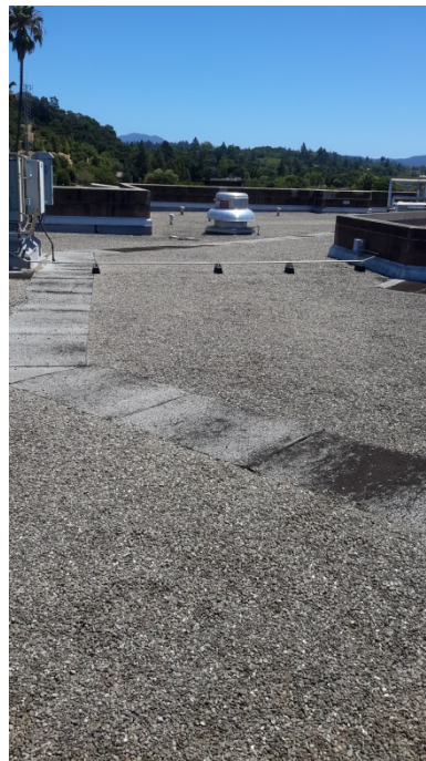
HEPA Filter on Negative Pressure Rooms for Aerosolized Transmissible Diseases- Additional PPE required During maintenance and repair