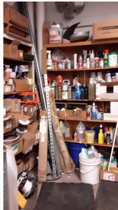
Storage- Various chemicals and supply