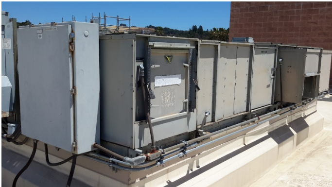
HVAC Unit- one of many that require maintenance and Repair