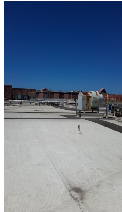
Roof with multiple elevations- tools, materials equipment lifted over half walls and carried up ladders