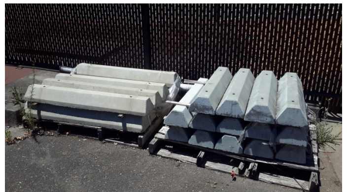
4 foot Parking Stop- 124 lbs. from 6" to 36" 2 person lift