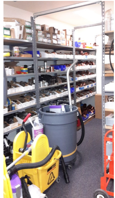
Storage for Plumbing projects