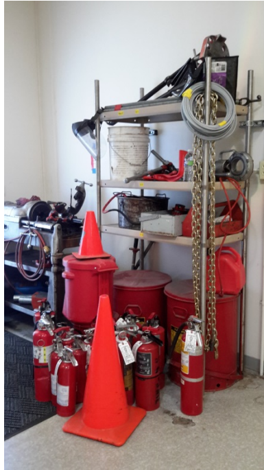
Fire Extinguishers- 10 lbs. to 30 lbs.