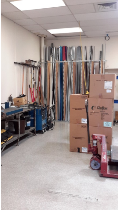
Various Tools and Materials