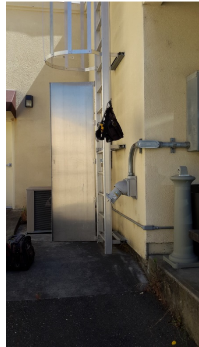
Roof Access- Pulley System for tools, materials and equipment- Awkward posture to bring tools to Roof, bent at waist with arms extended away from body.