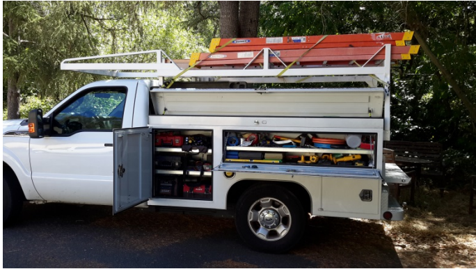
Example of Duty Truck- Storage from 22" to Roof Rack at 84" 8' Ladder – 30 lbs.