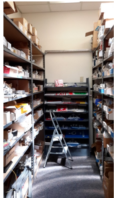
Storage of Signs and Small parts- Items stored from 4" to 84"