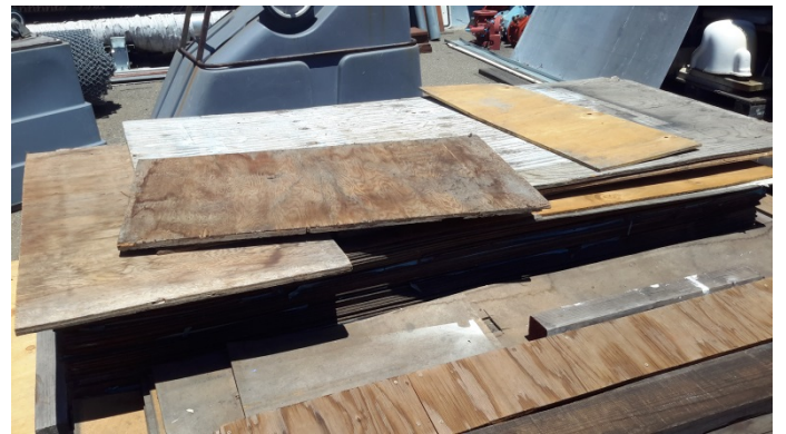
Full Sheet of 3/4" Plywood- 61 lbs. from 6" to 36"