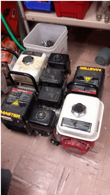
Portable Generators- 75 lbs. each