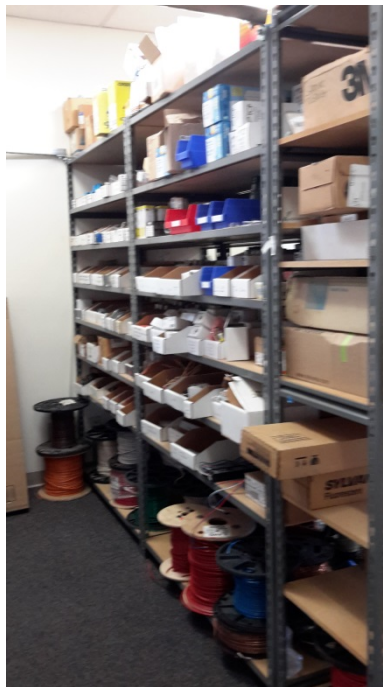
Storage of Small part and wire- Items stored from 4" to 84"