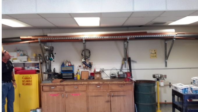
Pipe stored up to 84"- 2 person lift to move