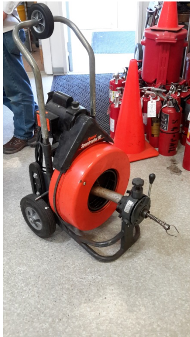
Large Snake- 200 lbs.- 2 person lift or Mechanical Lift Assist to load/unload