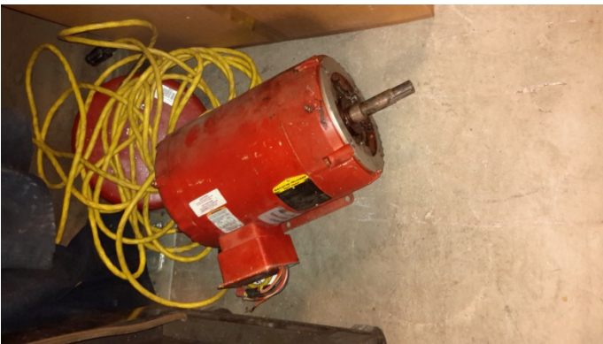
Sample of Motor- 110 lbs.