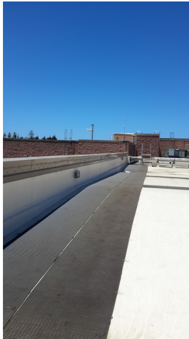
Roof- multiple ladders and half walls to traverse to access Equipment for maintenance or repair