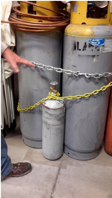
Compressed Air Tank- 52 lbs.