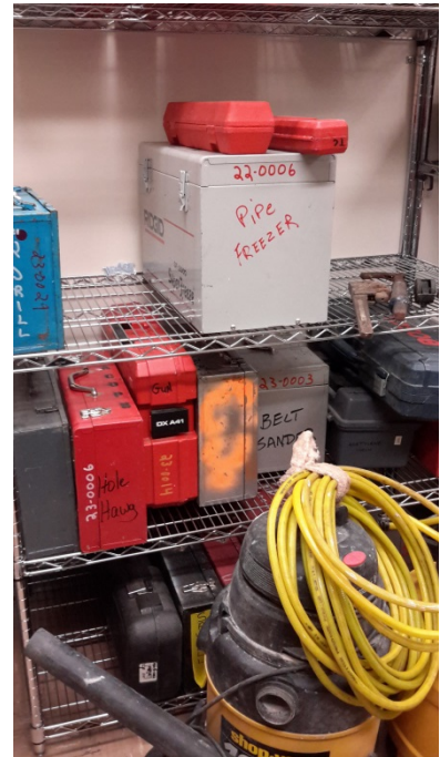
Various Tools- stored at 40" Pipe Freezer- 45 lbs. Porta-Band- 34 lbs.