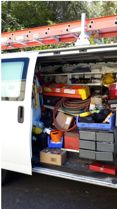
Duty Van- Ladder Rack 84" 5' Ladder in van - 20 lbs. 20' Extension Ladder - 45 lbs.