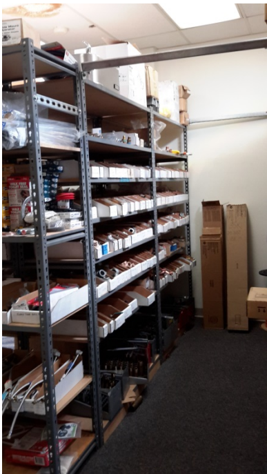
Storage of Small parts- Items stored from 4" to 84"