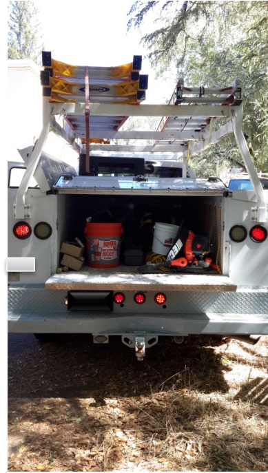
Duty Truck- Truck Bed at 36" high