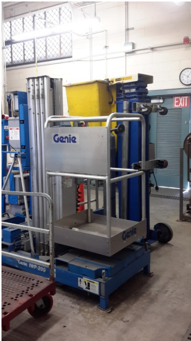
Man Lift and Bucket Lift