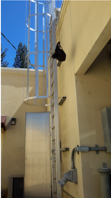
Roof Access- Use Pulley to bring Tools, materials and equipment To roof