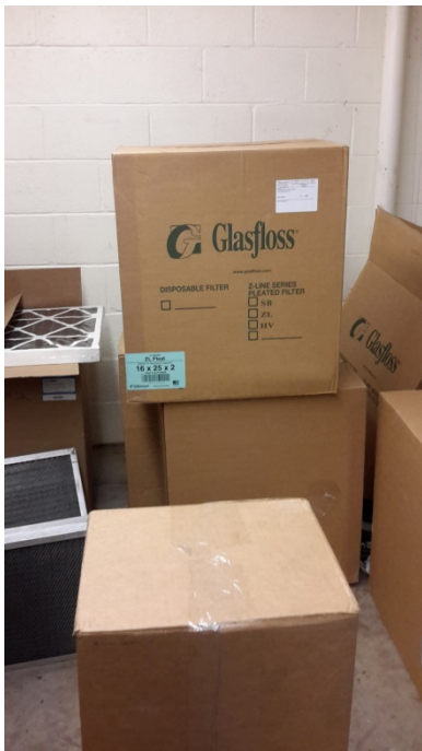
Air Filters- 12 each box at 15 lbs. Quarterly filter change can use 45 to 50 boxes (up to 600 filters)