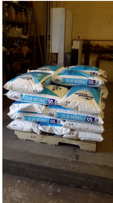
Bags of Salt- 50 lbs. from 6" to 36"