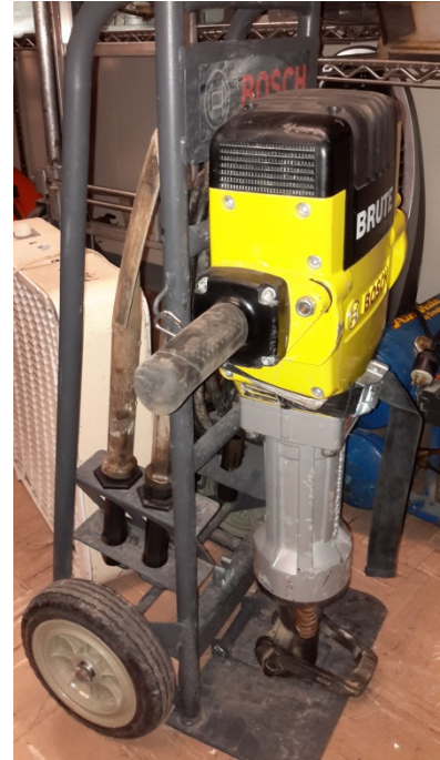
Jackhammer and accessories- 115 lbs.