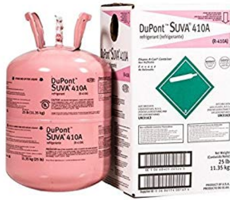
Refrigerant- 35 lbs.