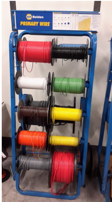
Stand for regularly used wire (Color Vision)