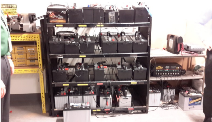
Battery Charging and Storage- weighing 44 lbs. to 66 lbs Battery handle 11 inches high. Batteries moved from floor, and shelves at 4 inches, 19 inches, 33 inches, 47 ½ inches