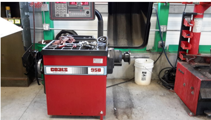
Wheel Balancer- Lift tire and wheel 30 inches to shaft