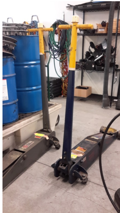
Jack- push force = 18.5 lbs.