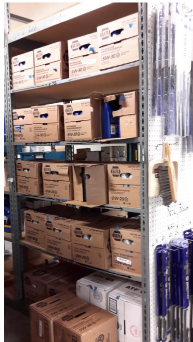
Storage of Oil and other Fluids (Shelves stocked by delivery vendor) Items stored up to 78 inches high