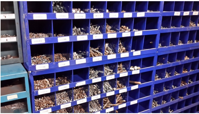
Storage of Nuts, Bolts, Screws, and other Hardware