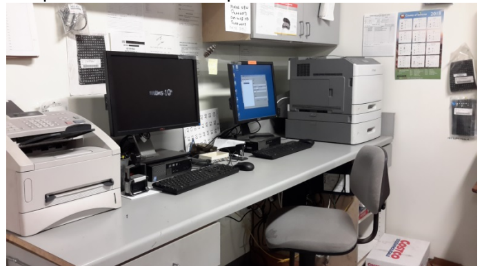
Computer work station in Store Room