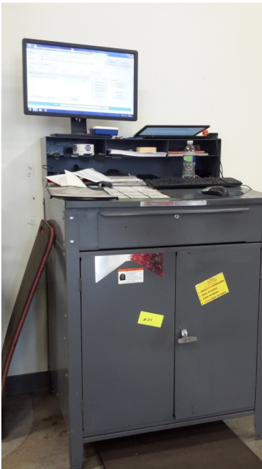
Computer Station in Garage