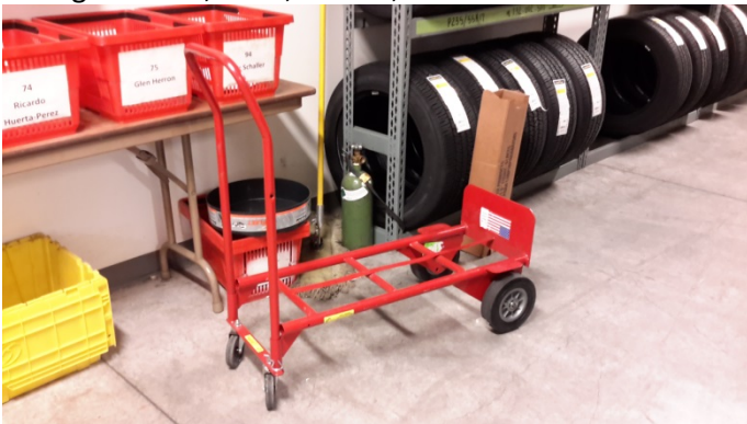
Sample of hand-truck used to move heavy/large items