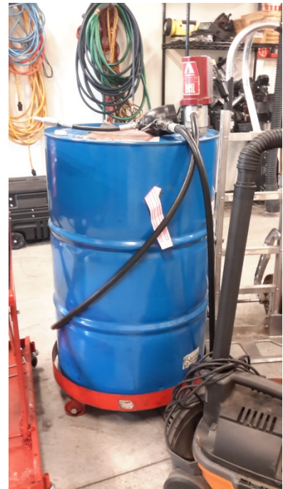
55 Gallon Oil Drum- 33 lbs. Push Force, when full