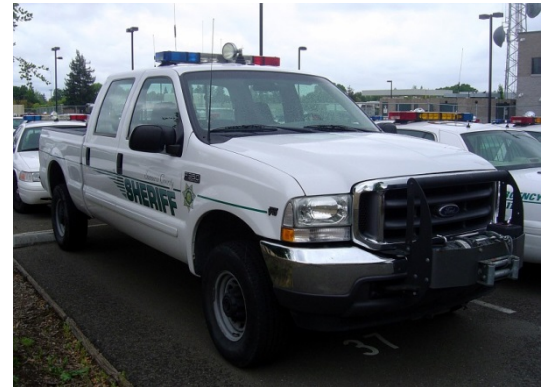
Install light bars on Patrol and Specialty Vehicles