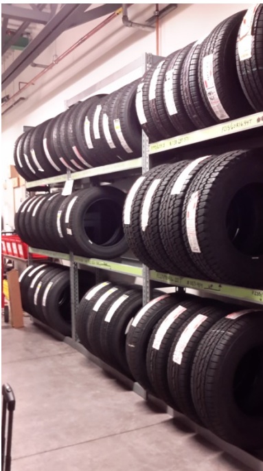
New Tire Storage- Various Sizes Most commonly used tire-18lbs. Tires stored up to 72 inches high