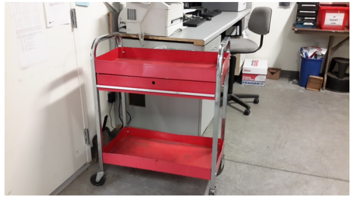
Sample of cart loaded and pushed to work site