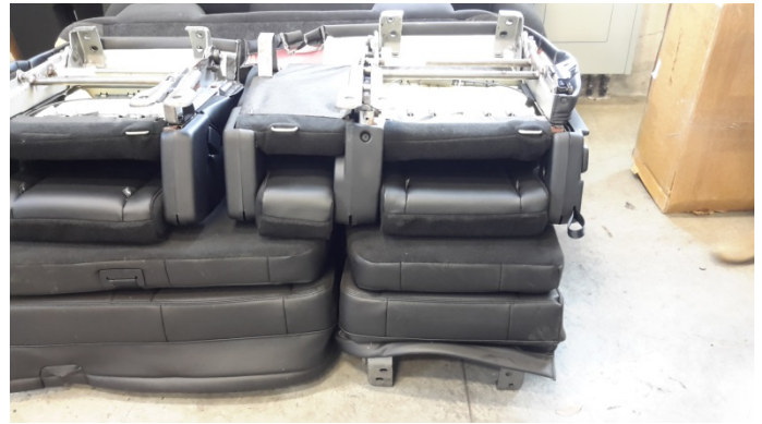
Seats from back of Patrol Vehicle-76 lbs. with center console- lifted from car and carried to a stack up to 42" high