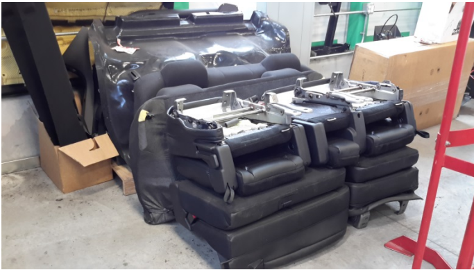
Stack of Back Seats removed from Patrol Vehicle to install Molded seats (stored and re-installed prior to auction)