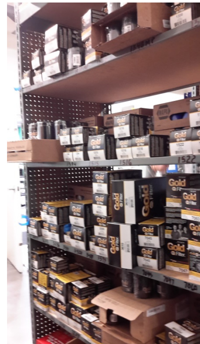
Storage of various Filters (Shelves stocked by delivery vendor) Items stored up to 72 inches high