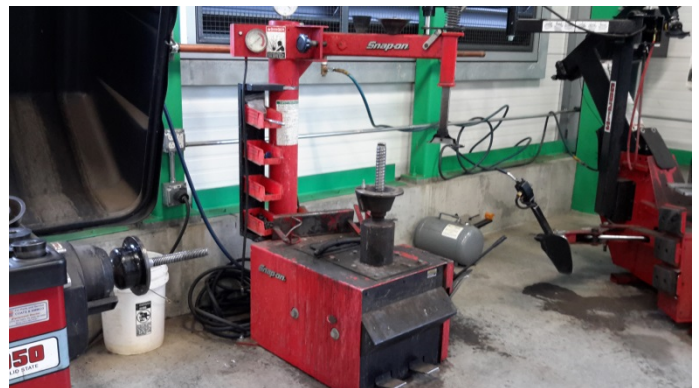
Tire Mounting Machine- 42 inch lift to clear shaft with rim and tire