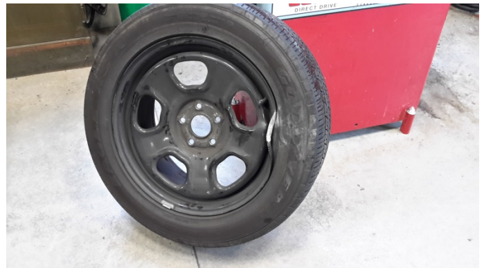
Damaged Patrol Vehicle Tire and Rim - 70 lbs.