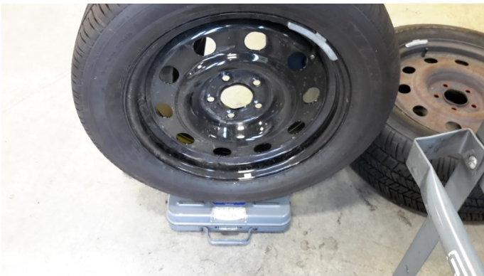
Patrol Vehicle Tire and Rim - 70 lbs.