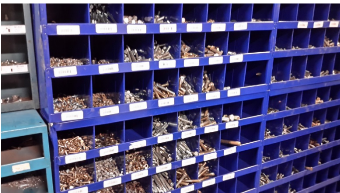
Storage of Nuts, Bolts, Screws, and other Hardware