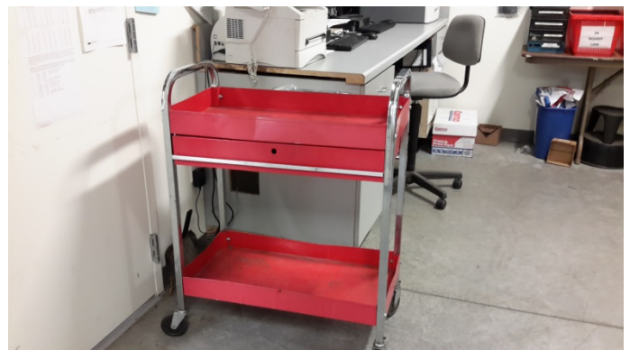
Sample of cart loaded and pushed to work site