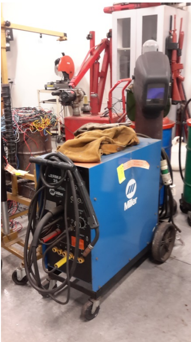
Mobile Welder- 22 lbs. Push Force