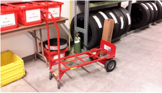
Sample of hand-truck used to move heavy/large items