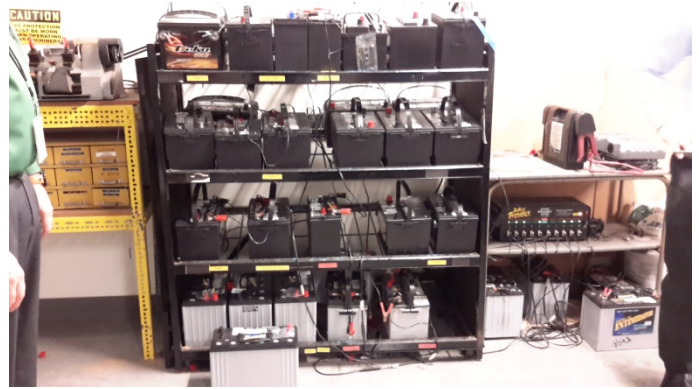
Battery Charging and Storage- weighing 44 lbs. to 66 lbs. Battery handle 11 inches high. Batteries moved from floor, And shelves at 4 inches, 19 inches, 33 inches, 47 ½ inches