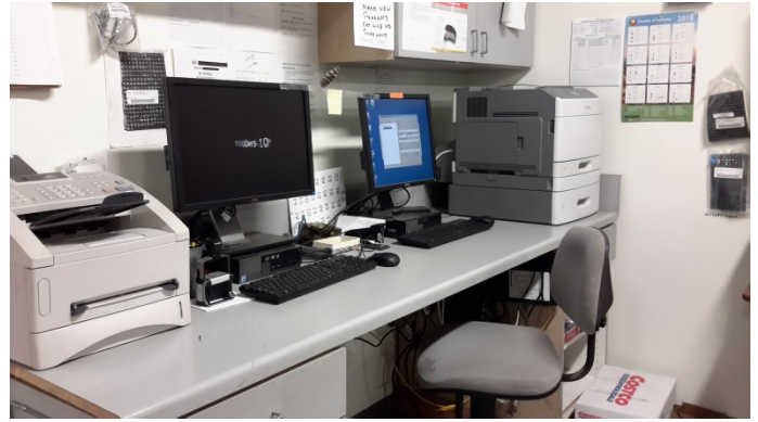
Computer work station in Store Room