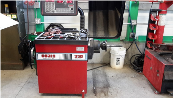
Wheel Balancer- Lift tire and wheel 30 inches to shaft