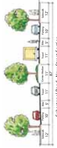
Sebastopol Road - New Street Section