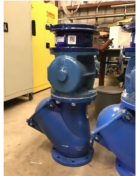
Pump, Valve, and Flange (3 pieces) 3-person team to change