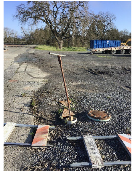
Sample of Handle to “exercise” valves ~48” high