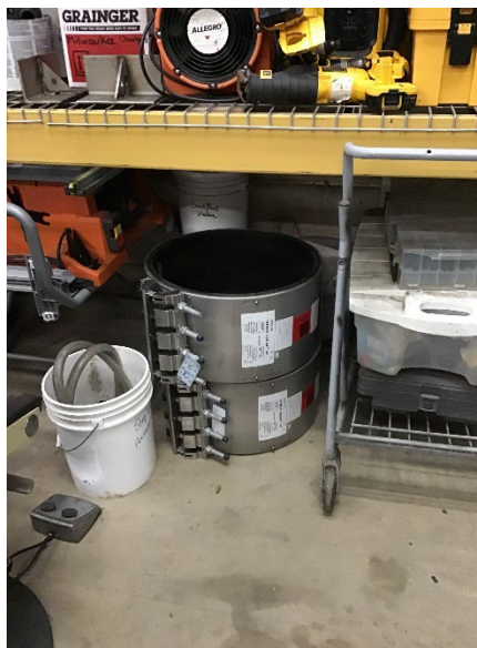
Coupling and Repair Clamps – 48lbs. Carried 20'-25' floor to work truck (Truck bed = 39" high)