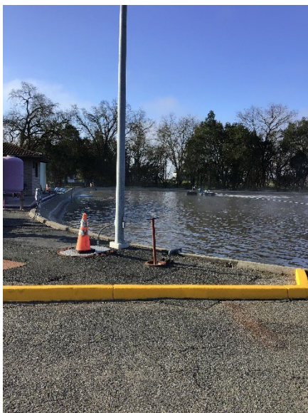
Sample of Handle to “exercise” valve ~30” high