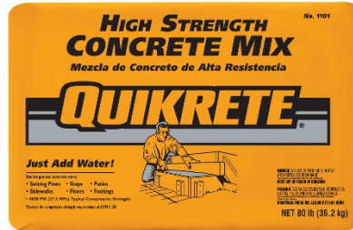
Bags of Concrete – Up to 80 lbs.