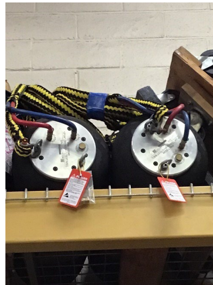
“PIG” Test-Ball Plug – 24”- 48” = 125 lbs. Pictured 12”-24”= 26.9 lbs. (stored overhead) Variable weight depending on diameter