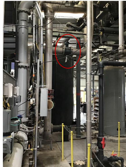
Overhead Meter circled - Install; monitor; repair, as needed