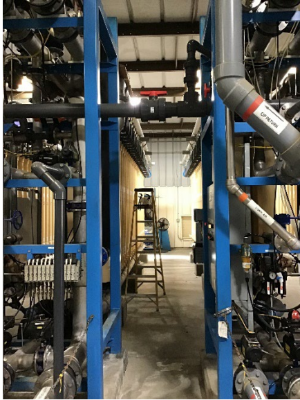
Ladder in place for overhead work- Acid lines, Filter Lines, Overhead Meters (May climb ladders with hand tools, flash light)