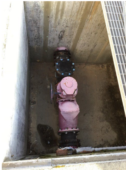
Sample of Vault – confined space Perform repairs and installations Accessed via Ladder