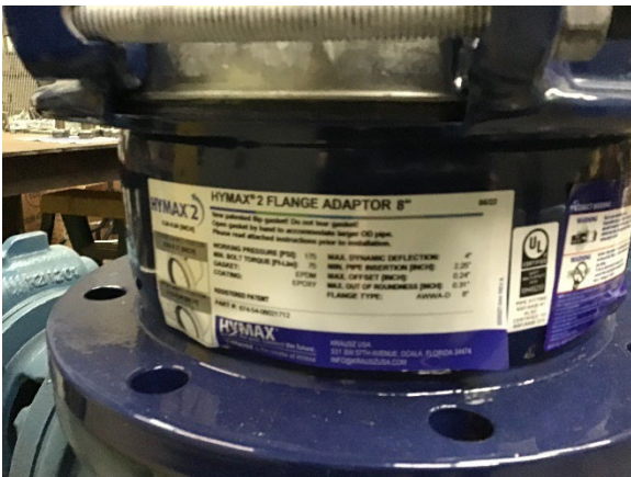
Flange Adaptor = 32 lbs.