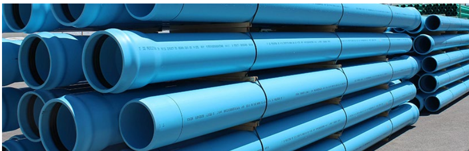
C900 PVC Pipe may be loaded to Lumber Rack (80" high) – Pipe size may vary from diameter of 4" to 24"; typically delivered at 20' long