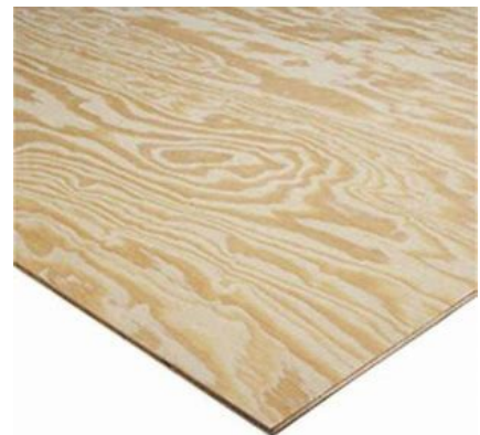
Plywood – 4’ x 8’ x ½” = avg. 43 lbs.

Lead Mechanics and Mechanics work in a variety of locations and settings throughout Sonoma County. Mechanical lift assists (i.e., hoist; fork lift; crane; winch; trolley, cart or hand truck) are used, when possible.