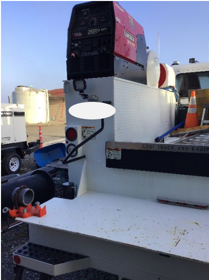
Welder/Generator Mounted on truck