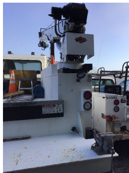
Work truck with crane for lifting heavy items