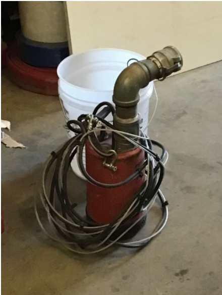
Pump = 40 lbs. Carried 20'-25' floor to work truck (Truck bed = 39" high)