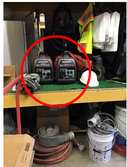
Generator 50lbs. on 34-inch shelf Carried 20'-25' floor to work truck (Truck bed = 39" high)