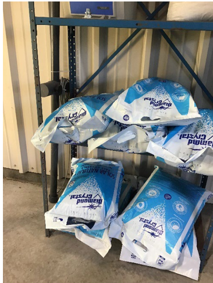
Salt bags – 40 lbs.