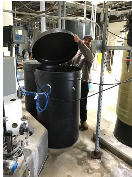
Salt added to Conditioner/Softener 40lbs. from 6-inches to 48-inches high