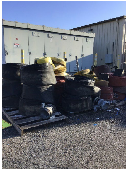
Hoses – different diameters and weights – up to 62 lbs. Loaded to trucks on pallet with fork lift