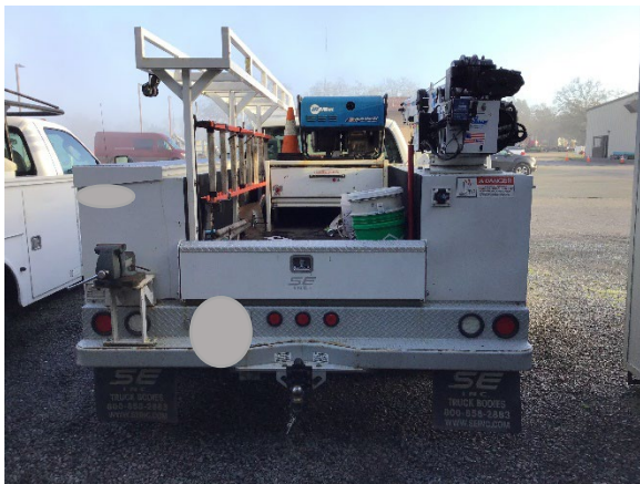
Work truck- Lumber Rack 80-inches high