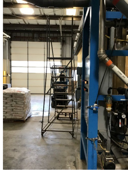
Safety Ladder for overhead work- Acid lines, Filter Lines, Overhead Meters