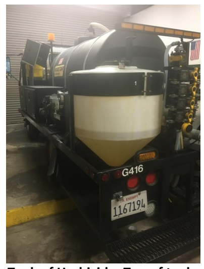
Tank of Herbicide- Top of tank At 64" from floor; 46" from step