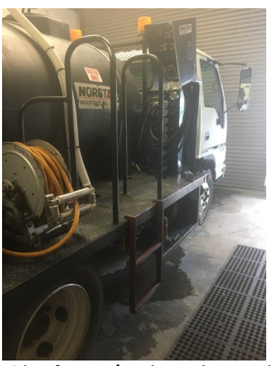
Side of Spray/Tank Truck- Portable Ladder Steps at 12" – 24" – 36" to bed of truck