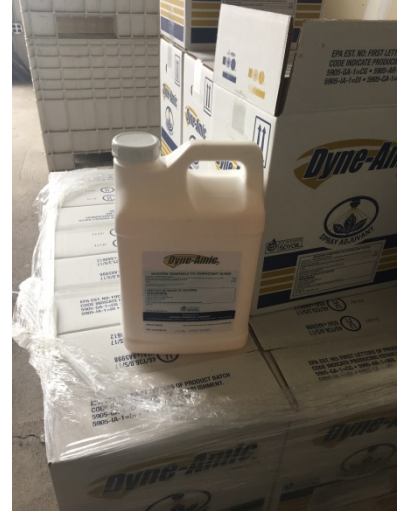
Single container of Herbicide= 18lbs. Moved from 6" pallet to 55" Utility Storage on Pick-up truck