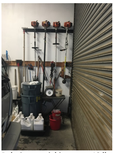
Pole Saw- weighing up to 13 lbs. Weed Whacker- 17 lbs.