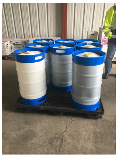
Full Herbicide- 15 gal. = 125.1 lbs. Lowered from 6 in. surface to ground