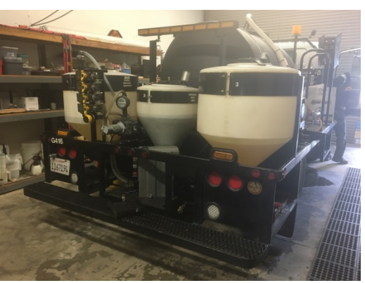
Spray/Tank Truck Step Height- 18 inches from ground