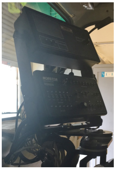
Controls for Spray/Tank Truck-Typically controlled by passenger