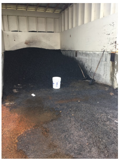
Cold Mix Asphalt Repair Material Shovel and 5 Gallon Bucket for Pot hole repair