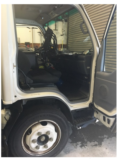
Passenger side of Spray/Tank Truck