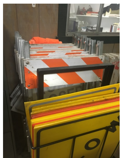
Barricades- 15 lbs.