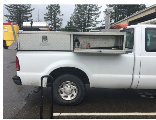
Utility Bed on Pick-up Bottom of Storage at 55" from groundHerbicide and Chainsaws stored here