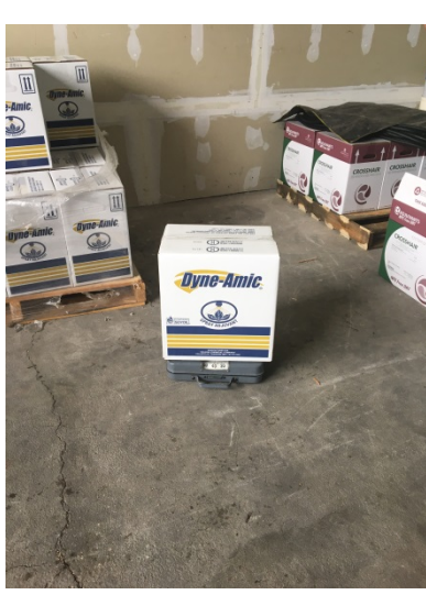
Case of Herbicide- 40 lbs. Case Handle at 13 inches