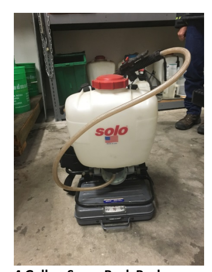
4 Gallon Spray Back Pack-(Typically filled with ONLY 3 Gallons) Empty- 10 lbs.; Plus 3 Gal. - 35 lbs. ; Plus 4 Gal. - 43 lbs.