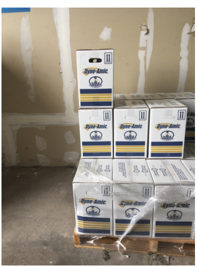
Cases stored from 6" to 52"