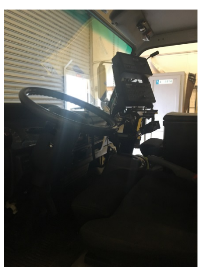
Driver's Side of Spray/Tank Truck