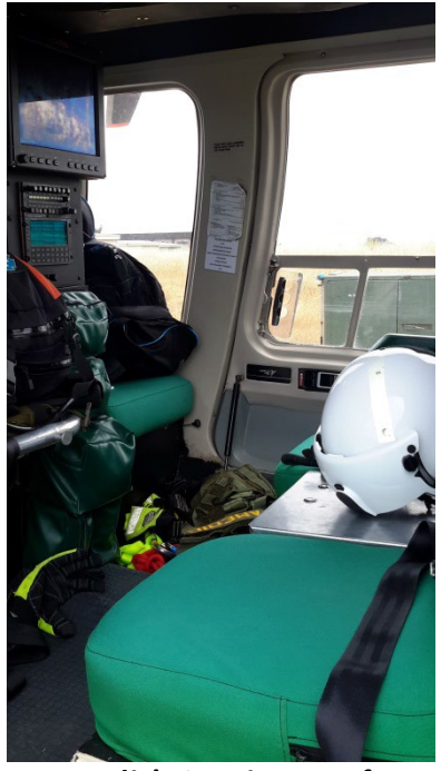
Paramedic's Seat in rear of Helicopter-gurney in front of Paramedic