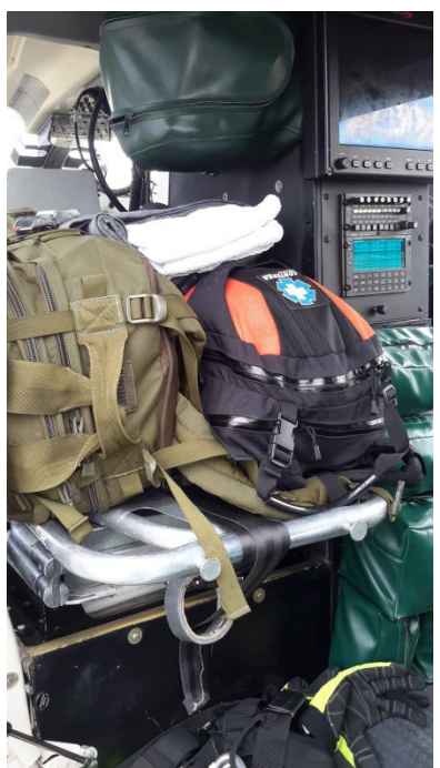
Rescue Gear/Medical Equipment -gurney for patient in front of