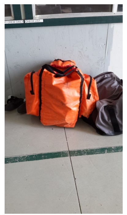
Rope Bucket - 90 lbs.