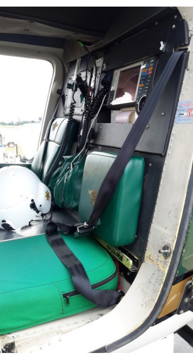
Paramedic and Deputy Seats in rear of helicopter