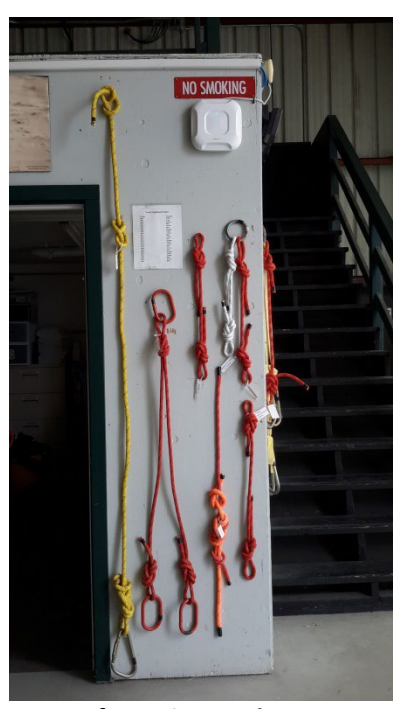
Ropes - for various tasks