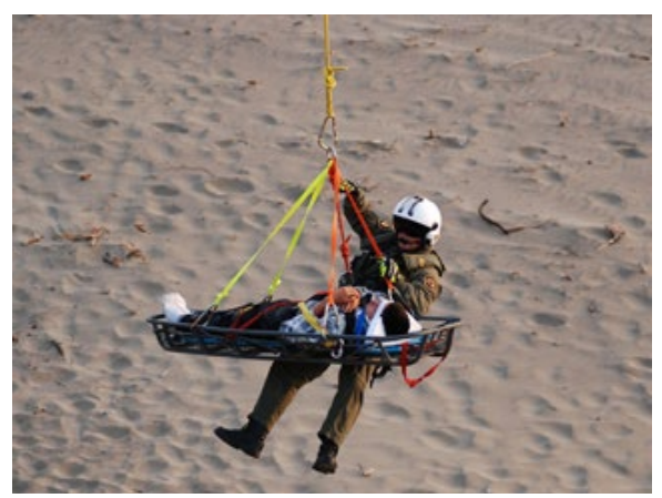
Paramedic with patient at end of long line