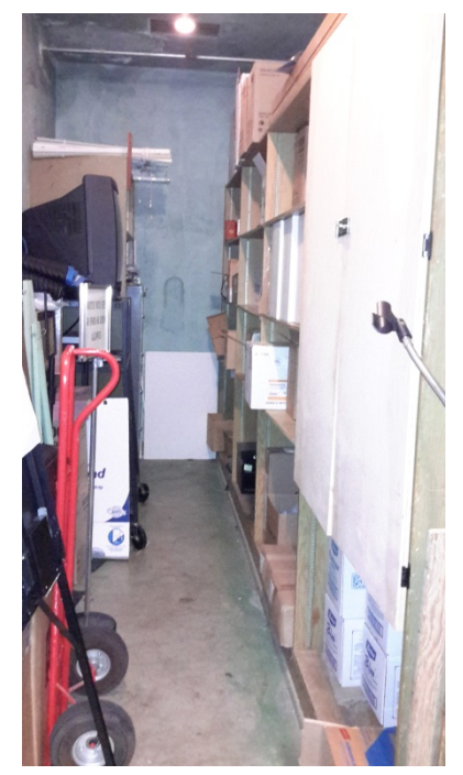
Supply Storage- items up to 72"