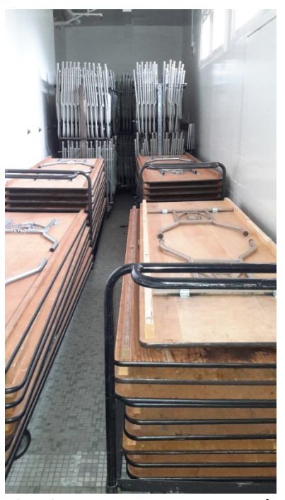
3' x 8' Banquet Tables- 55 lbs./table (10 per cart) Handle 39", Push Force- 72lbs.; Pull Force- 84 lbs. Standing Chair Racks- 10 lbs./chair (40 per cart) Push Force- 92 lbs.; Pull Force- 99 lbs.