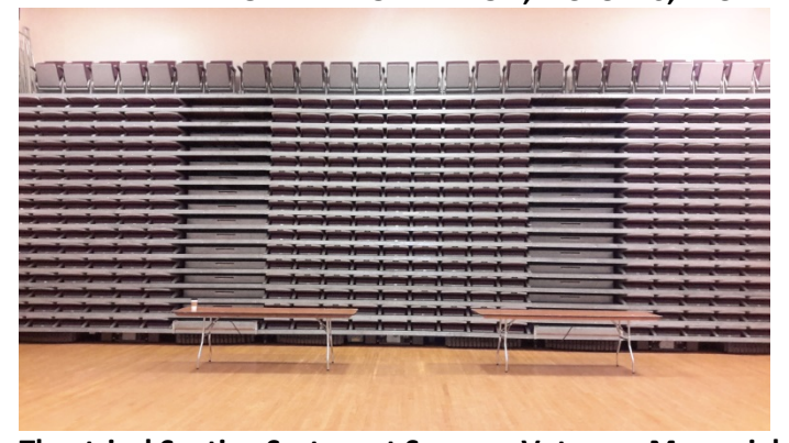
Theatrical Seating System at Sonoma Veterans Memorial Hall Auditorium- seating capacity 345 people