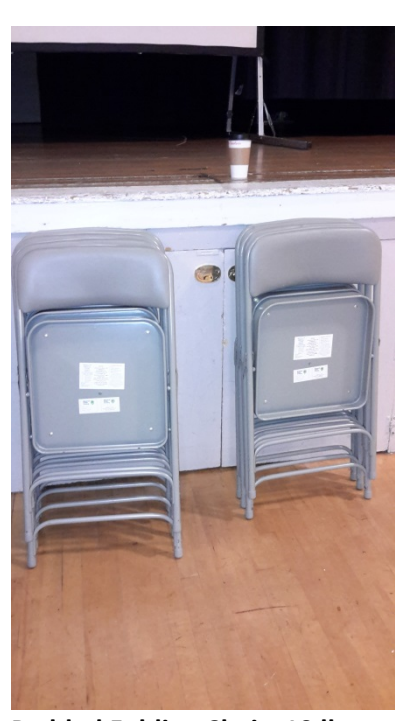
Padded Folding Chair- 10 lbs. each