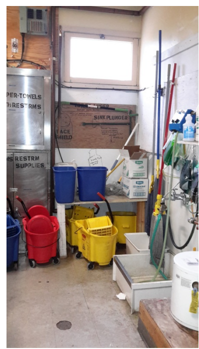
Janitor Supply Closet-Cleaning Solution- 33 lbs. to 36"