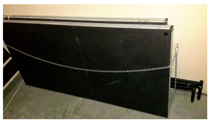
Portable Stage/Platform, each piece 96"x 49"x 4"- 100lbs.