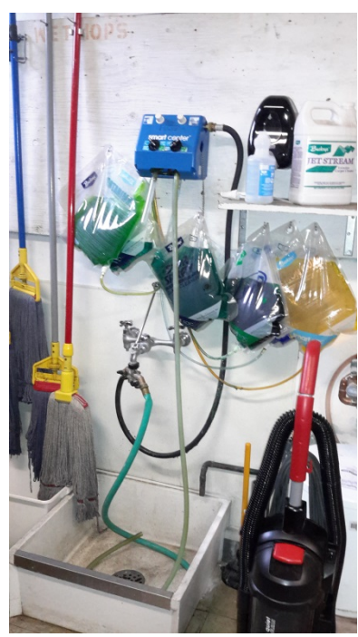
Janitor Supply Closet-Bag of Cleaning Solution- 11 lbs. to 63"