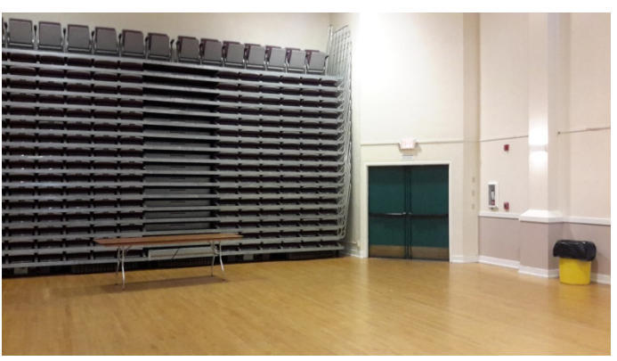
Theatrical Seating System at Sonoma Veterans Memorial Hall Auditorium- telescoping seating system