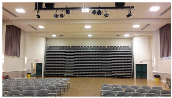
Sonoma Veterans Memorial Auditorium