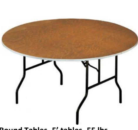
Round Tables- 5' tables- 55 lbs. 6' table- 85 lbs.