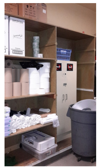
Janitor Supply Closet-Toilet Paper- 16 lbs. at 63" high