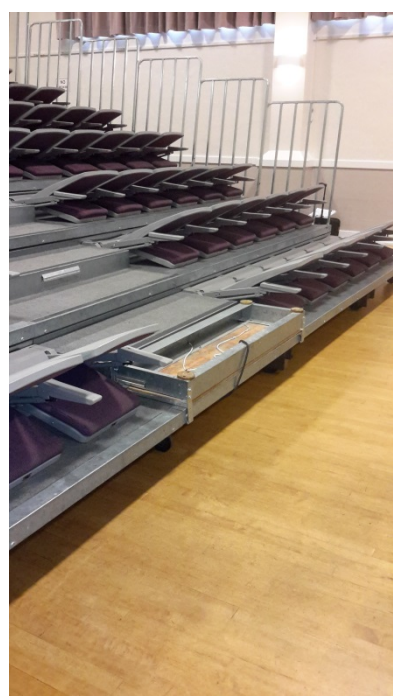
Theatrical Seating- Step Folds Down