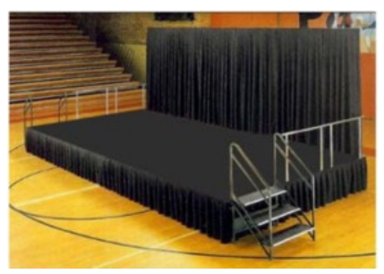
Example of Portable Stage