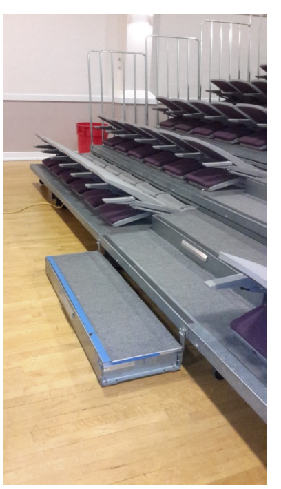
Seat back height 16" when folded Each Row lifted into place manually 48 Rows total to be lifted into place