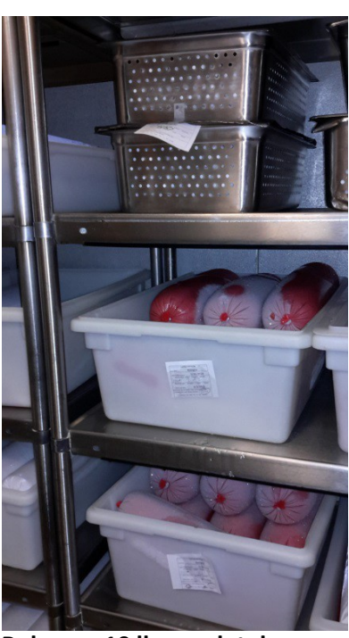
Bologna- 10 lbs. each tube