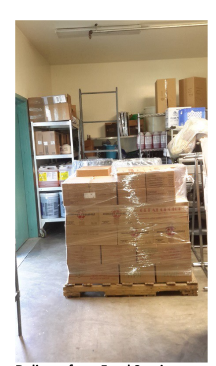
Delivery from Food Service