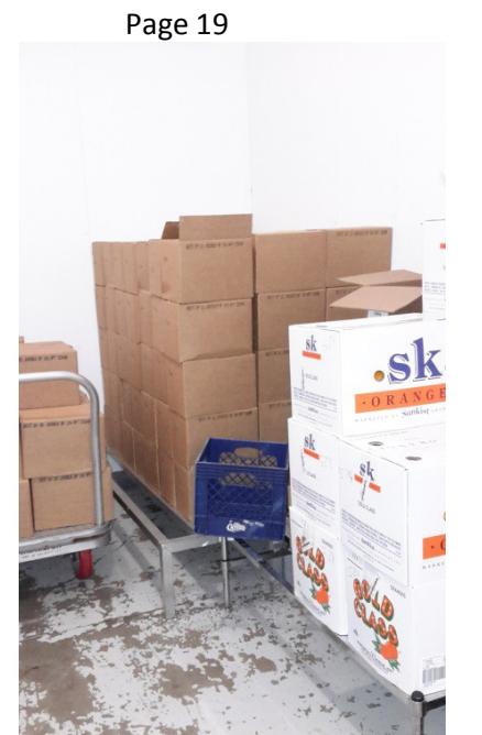
Cases of Apples and Oranges- 40lbs.