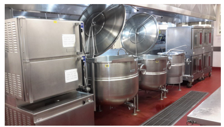
Steamer, Steam Kettles, Ovens