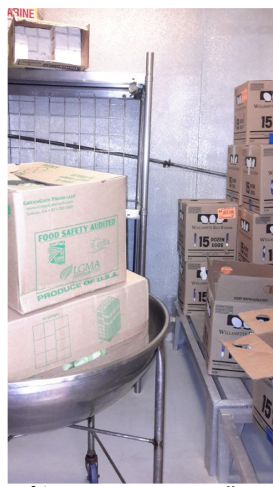
Refrigerator- Lettuce – 20 lbs. 15 Dozen eggs- 25 lbs. up to 48"