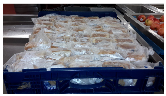
Lunch Tray (sandwich, cookies, juice packet) - 35 lbs.