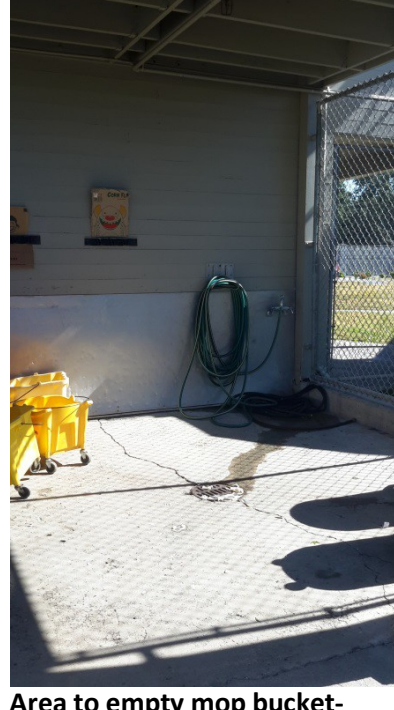
Area to empty mop bucketno overhead lighting available