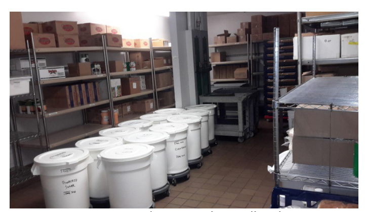
Dry Storage- Dry ingredients in white rolling bins; Case of #10 can crushed tomatoes- 44 lbs., From 12" to 64"