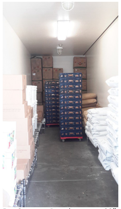
Dry Storage- Bread trays-up 80" Corn Flakes- 33lbs from 12" to 90" Pinto Beans- 50 lbs. from 12" to 64" Apple Jelly- 45 lbs. bucket with no handle, From 12 to 44"