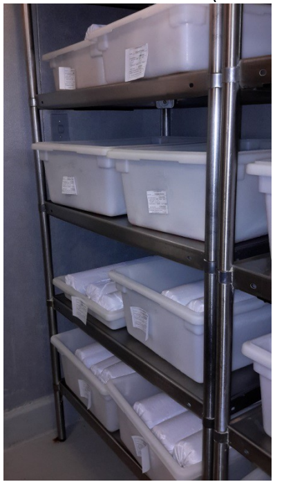
Ground Chicken- 10lbs. each tube