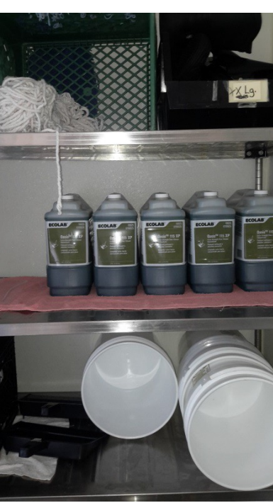
Cleaning Supplies and Solutions Oasis 115 XP floor cleaner- 21 lbs., up to 40"