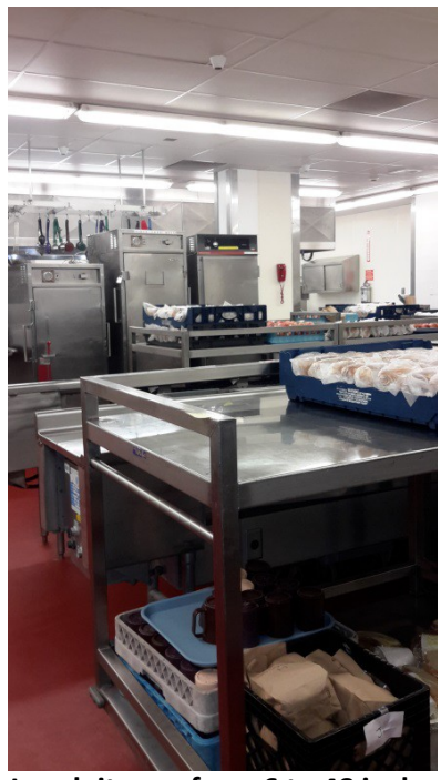
Lunch items- from 6 to 48 inches