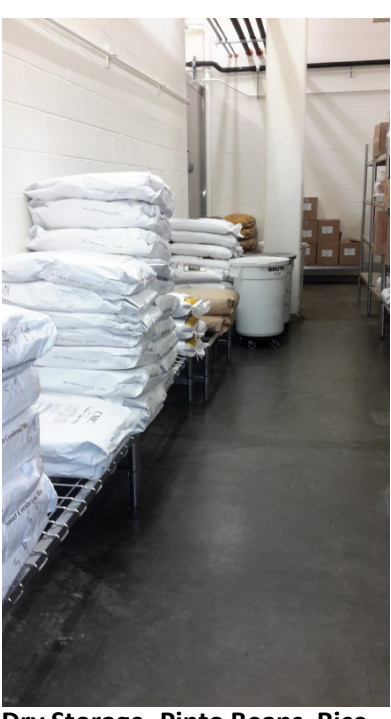
Dry Storage- Pinto Beans, Rice, flour, sugar, corn meal- 50 lbs. Canned Fruit – 43 lbs. up to 72"