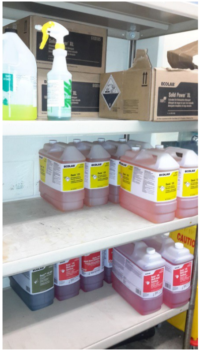
Cleaning Supplies- Various Lime Away- 1 gallon- 8 lbs. Solid Power XL- Case of 4, 36 lbs. Up to 54"