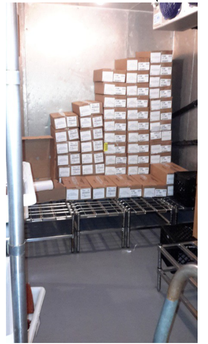
Packs of Baby Carrots- 20 lbs. From 12" to 72"