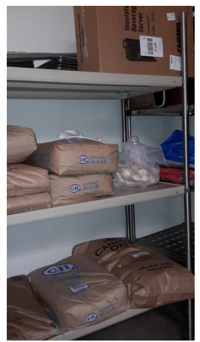
Powdered Sugar and Oats- 50 lbs. From 12" to 48"