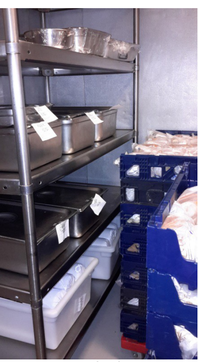
Food prepared for future meals