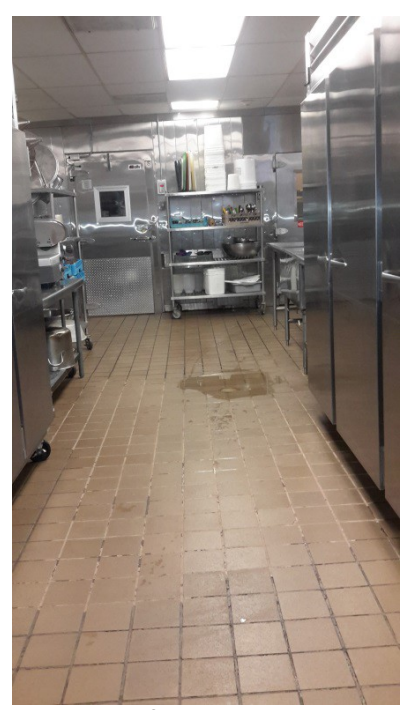
Reach in refrigerators on each Side of aisle