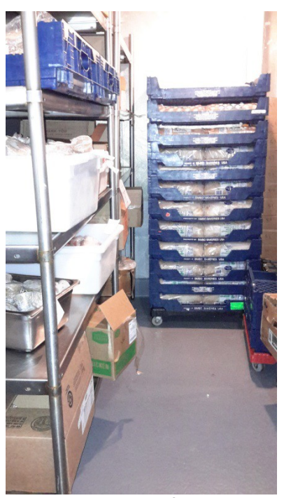
Various items in Refrigerator