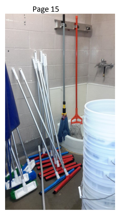
Janitor Closet, Cleaning Supplies