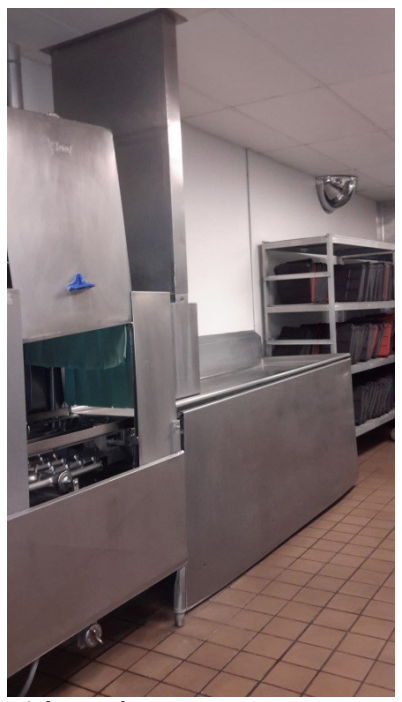
Dish Washer; Cart of meal trays