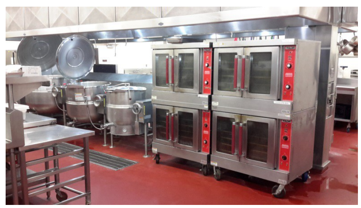
Ovens, Tilting Kettles