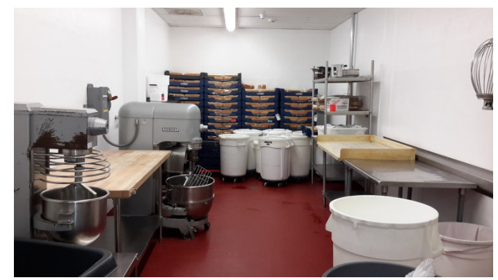
Baking Area- Racks of bread along back wall; Dry goods In rolling white bins; 2 mixers