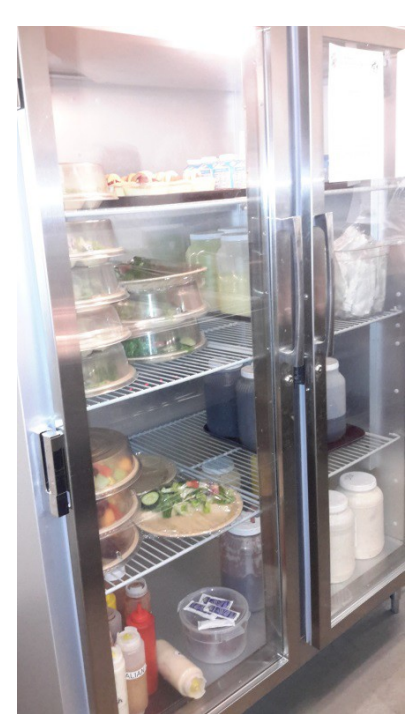
Staff Reach in Refrigerator in Break/Lunch Room