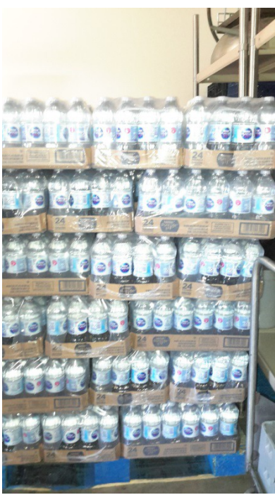
Emergency Water- 25 lbs.