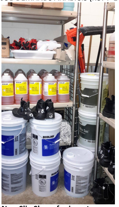
Non-Slip Shoes for inmates; Cleaning Solutions- 5 gallon, 55 lbs. Up to 32"