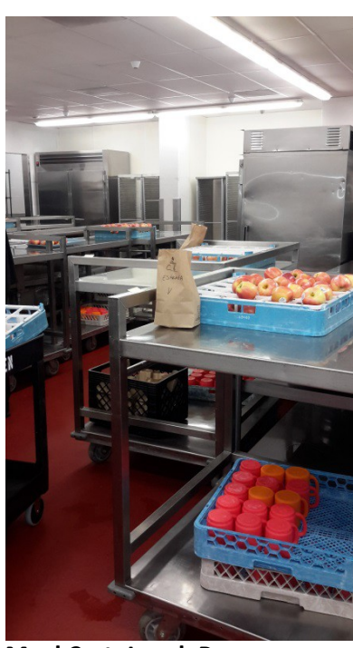
Meal Cart- Lunch Prep