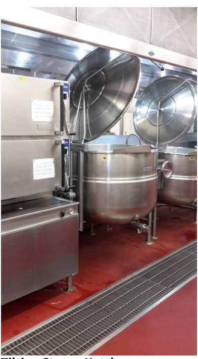
Tilting Steam Kettles