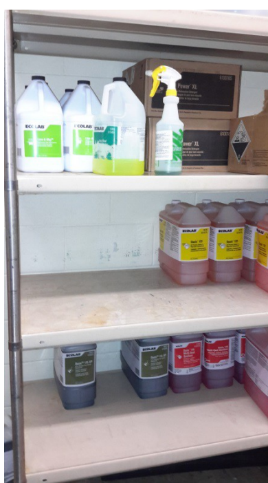
Cleaning Solutions- Various 2.5 Gallon- 21 lbs. up to 36"