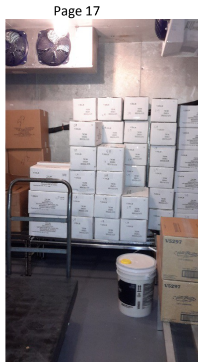
Broccoli Cuts- 20 lbs. From 12" to 72"