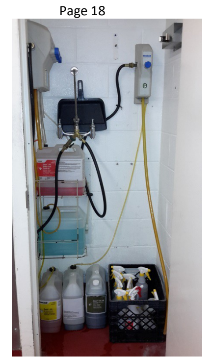
Janitor Closet- Cleaning solutions-21 lbs., from floor to 40"