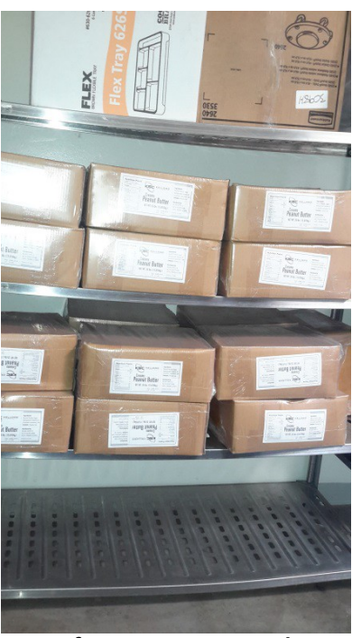
Case of Peanut Butter Packets- 35 lbs. From 12" to 48"