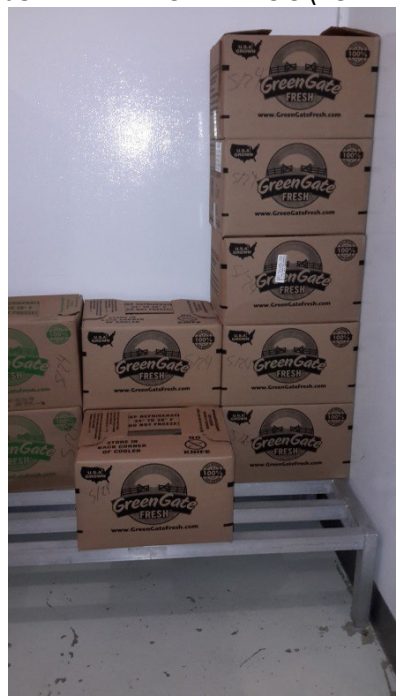
Cold Storage- Boxes of Lettuce or Cabbage- 20 lbs. up to 72"