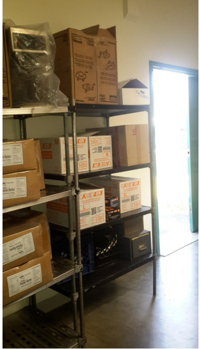
Dry Storage- Nitrile Gloves- 15lbs.