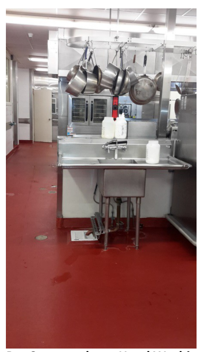
Pot Storage above Hand Washing Sink