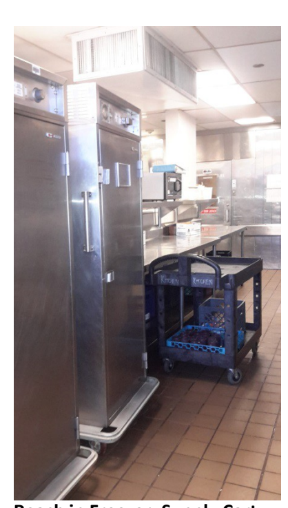
Reach in Freezer; Supply Cart