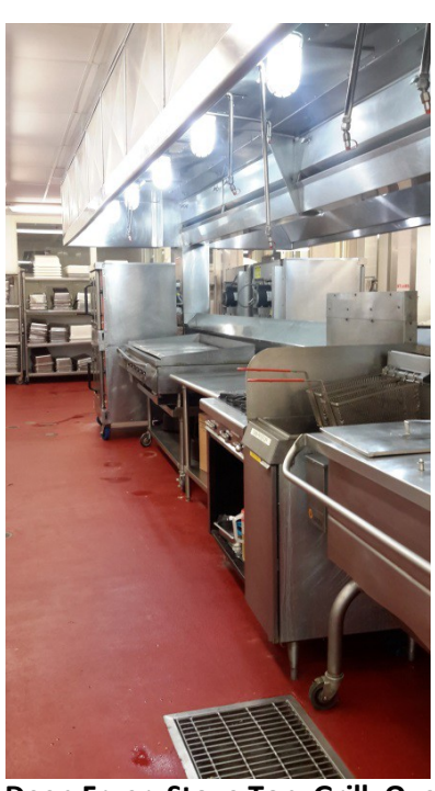
Deep Fryer, Stove Top, Grill, Ovens