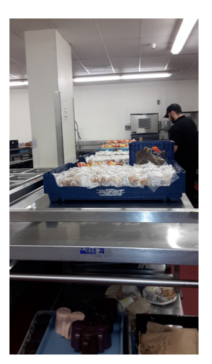
Cart for lunches- 48 inches high