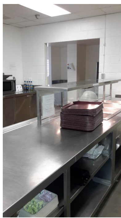
Staff Break/Lunch Room