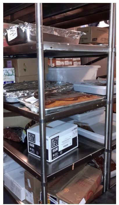
Variety of food items in refrigerator