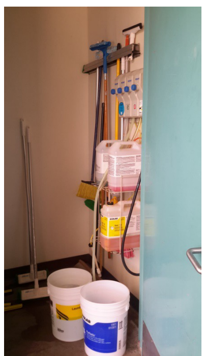
Cleaning Supplies and Solutions Various Solutions- 21 lbs. up to 40"