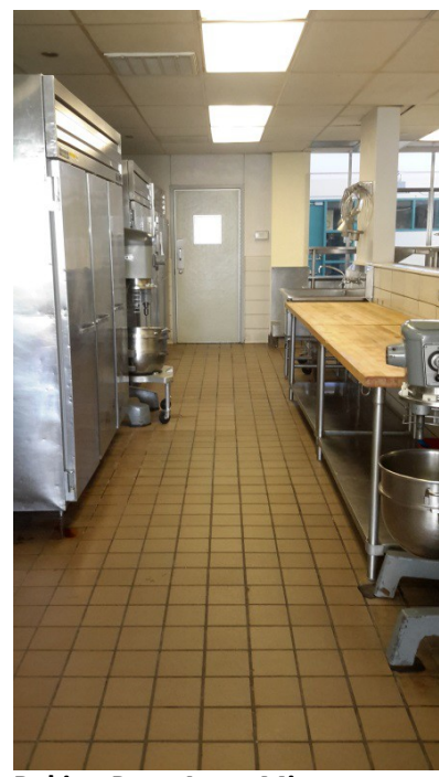
Baking Prep Area; Mixers