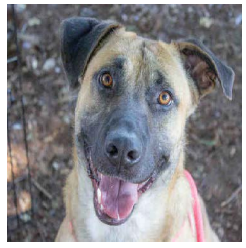
Example of currently adoptable dog Frodo - German Shepherd mix - 81 Ibs.