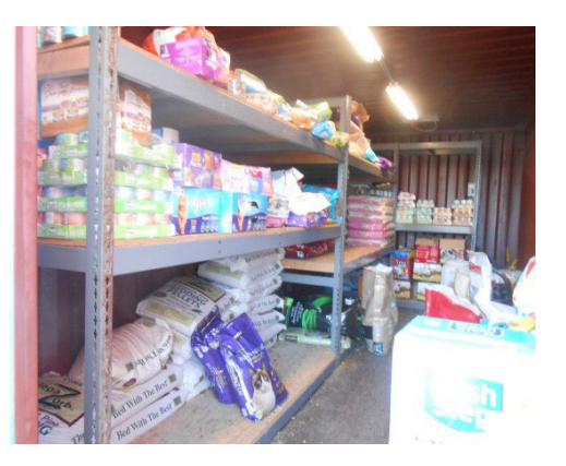
Food/Bedding/Litter Storage a 4" to 68" Bedding Pellets 4.5" x 13" x 19" – 50 lbs. Kirkland Maintenance Cat Food – 25 lbs. Canned Cat Food – 5"x1.5"x8" – 4.5 lbs. Puppy Food – 30 lbs., stored up to 68"