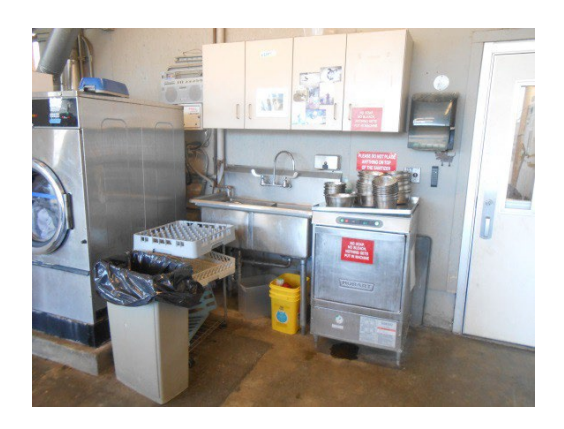
Laundry Area Towels stored at 50-inches, average weight 1.5 lbs. Animal Beds stack up to 68-inches – various sizes and weights