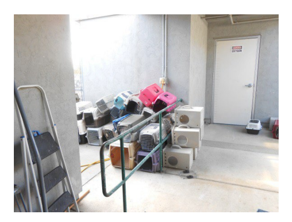
Storage for carrying crates – stacked up to 30-inches Example of crate 28'' \times 20.5'' \times 21.5'' - 10 lbs.