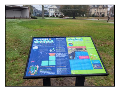
Example of Educational Signage