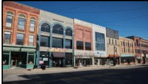
Small Business / Nonprofit Facilities