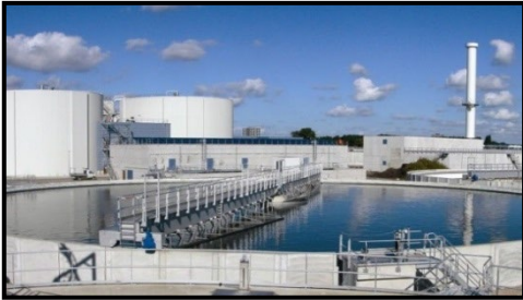
Water / Sewer / Storm / Flood