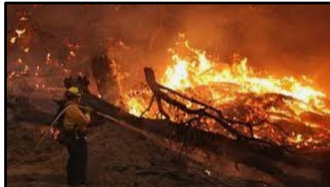
Wildfire Prevention / Other Climate Change Response